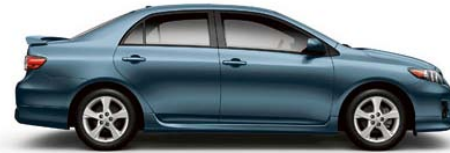
TROPICAL SEA METALLIC