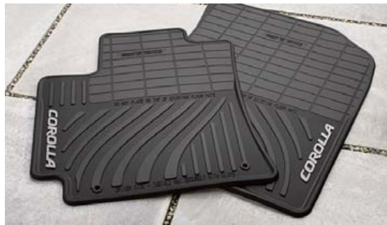
All-weather floor mats 22