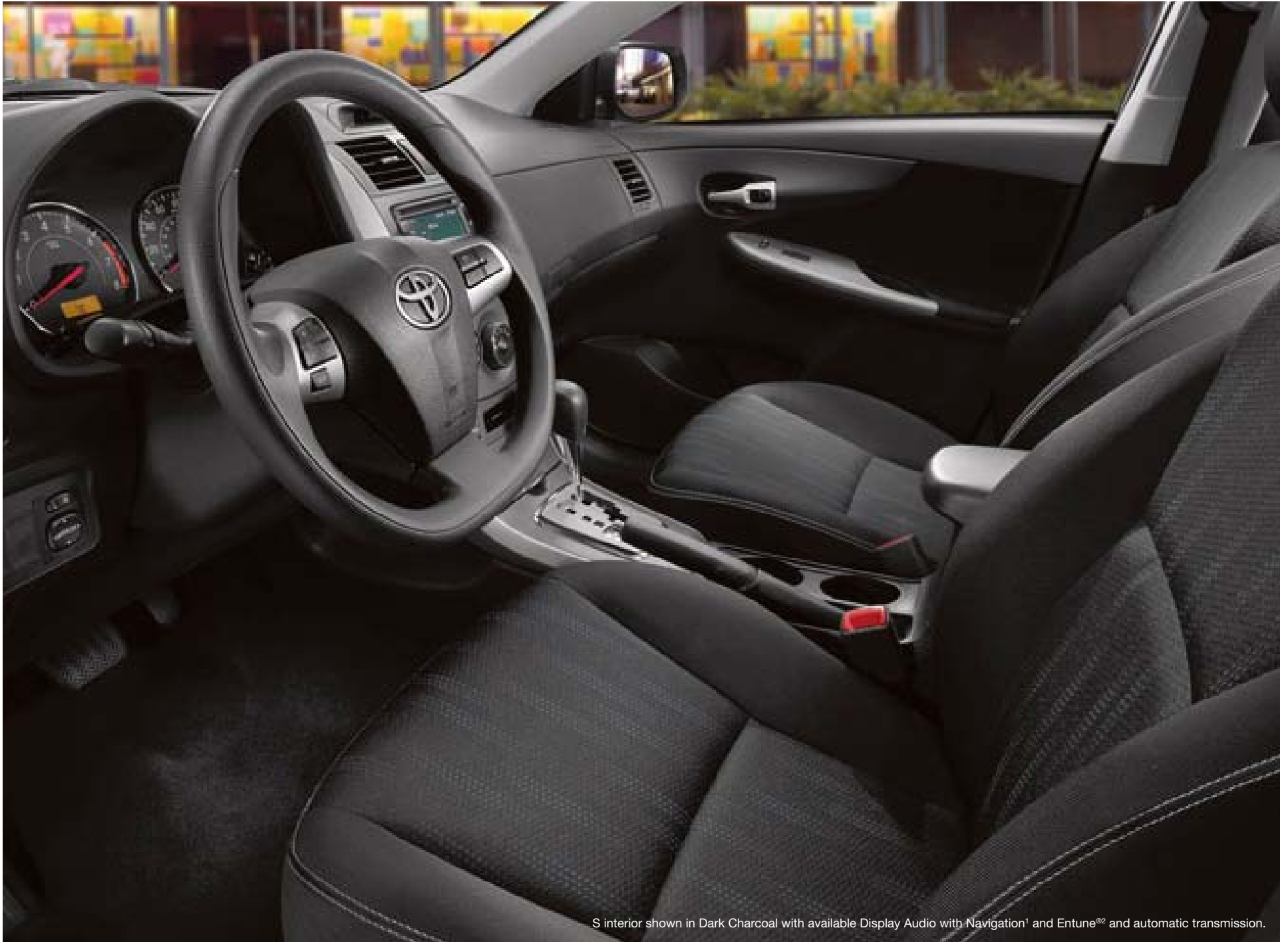
S interior shown in Dark Charcoal with available Display Audio with Navigation 1 and Entune ®2 and automatic transmission.