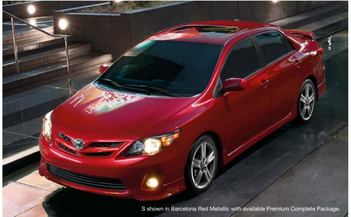
S shown in Barcelona Red Metallic with available Premium Complete Package.

Corolla's impeccable road manners begin with its rigid chassis. Built to resist body flex, it provides a reliable platform so that the suspension can do its job. The front suspension, mounted to an additional sub-frame to reduce noise and vibration, is tuned for precision handling. In back, the rear suspension employs a torsion-type design that further smooths the ride quality.