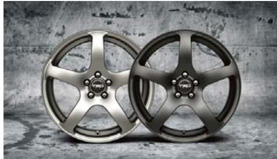
TRD 18-in. alloy wheels 27