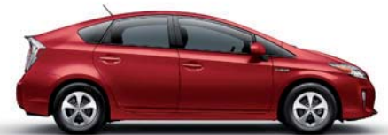
BARCELONA RED METALLIC