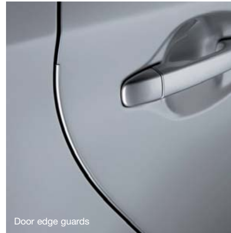
Door edge guards