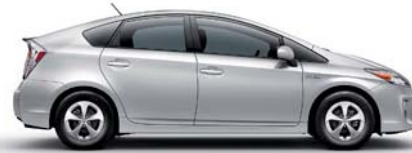
CLASSIC SILVER METALLIC