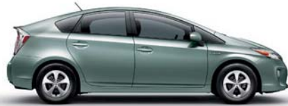
SEA GLASS PEARL