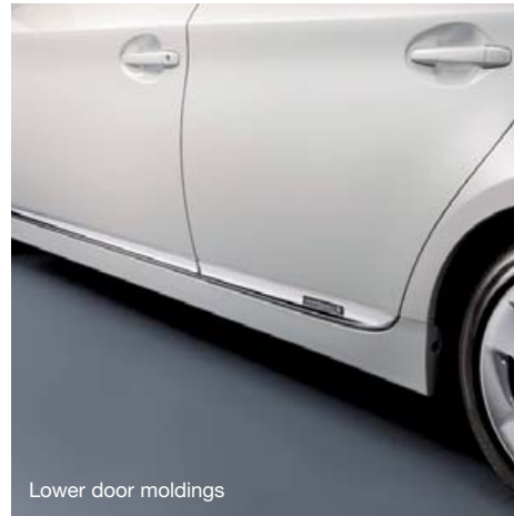
Lower door moldings