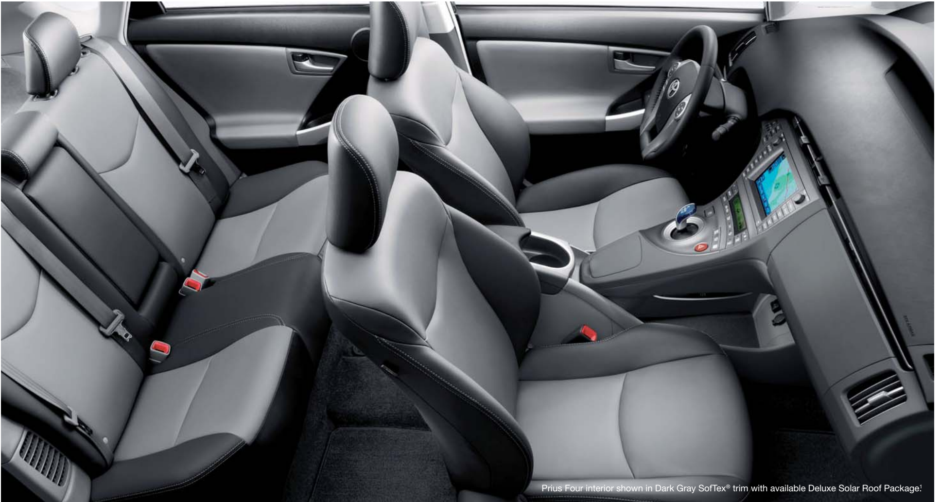
Prius Four interior shown in Dark Gray SofTex® trim with available Deluxe Solar Roof Package!

Getting comfortable is easy, thanks to the available 8-way power-adjustable driver's seat with power lumbar support that lets you find your ideal position.