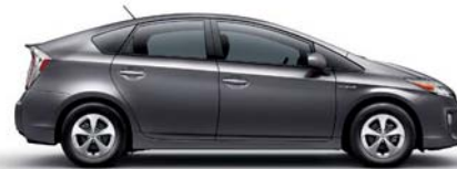
WINTER GRAY METALLIC