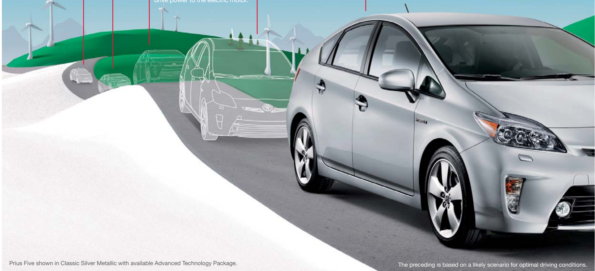
Prius Five shown in Classic Silver Metallic with available Advanced Technology Package.

GASOLINE ENGINE The series-parallel Hybrid Synergy Drive® helps the gasoline engine deliver both power and fuel efficiency.