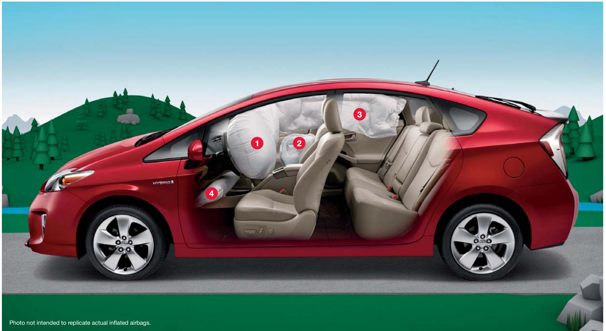
Photo not intended to replicate actual inflated airbags.

This airbag does more than its name suggests. In the event of a frontal collision, it can also help reduce the force on the chest and abdomen.