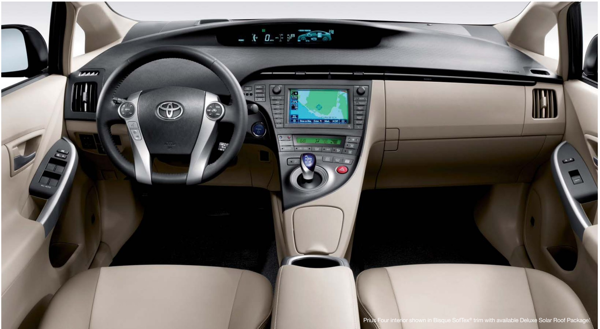
Prius Four interior shown in Bisque SofTex® trim with available Deluxe Solar Roof Package!

1. See footnote 2 in Disclosures section.