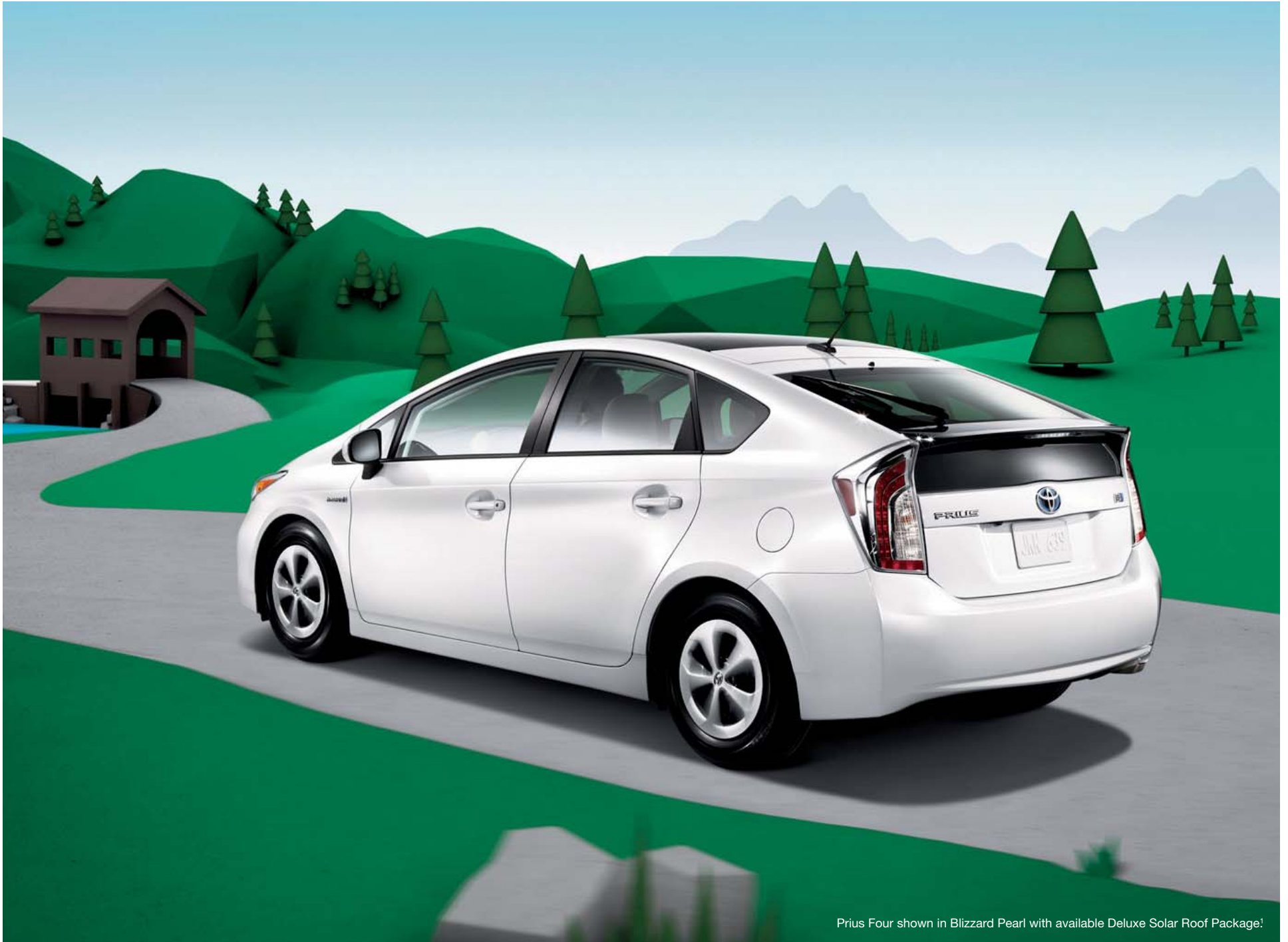
Prius Four shown in Blizzard Pearl with available Deluxe Solar Roof Package!