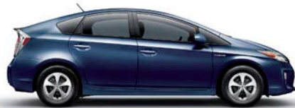
NAUTICAL BLUE METALLIC