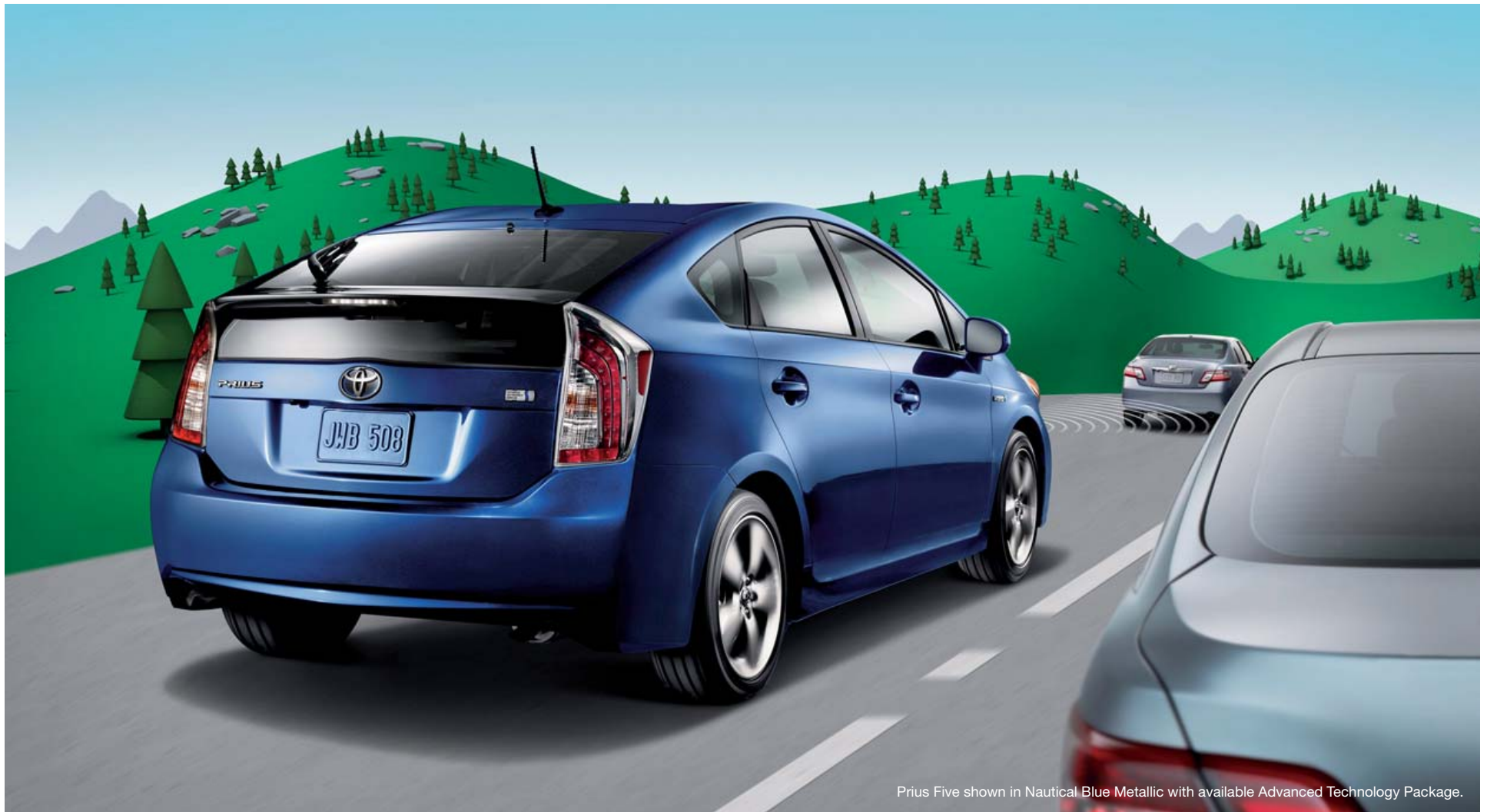
Prius Five shown in Nautical Blue Metallic with available Advanced Technology Package.