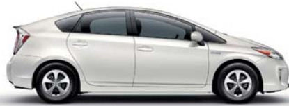
BLIZZARD PEARL (extra-cost color)