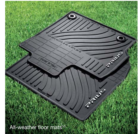
All-weather floor mats 10