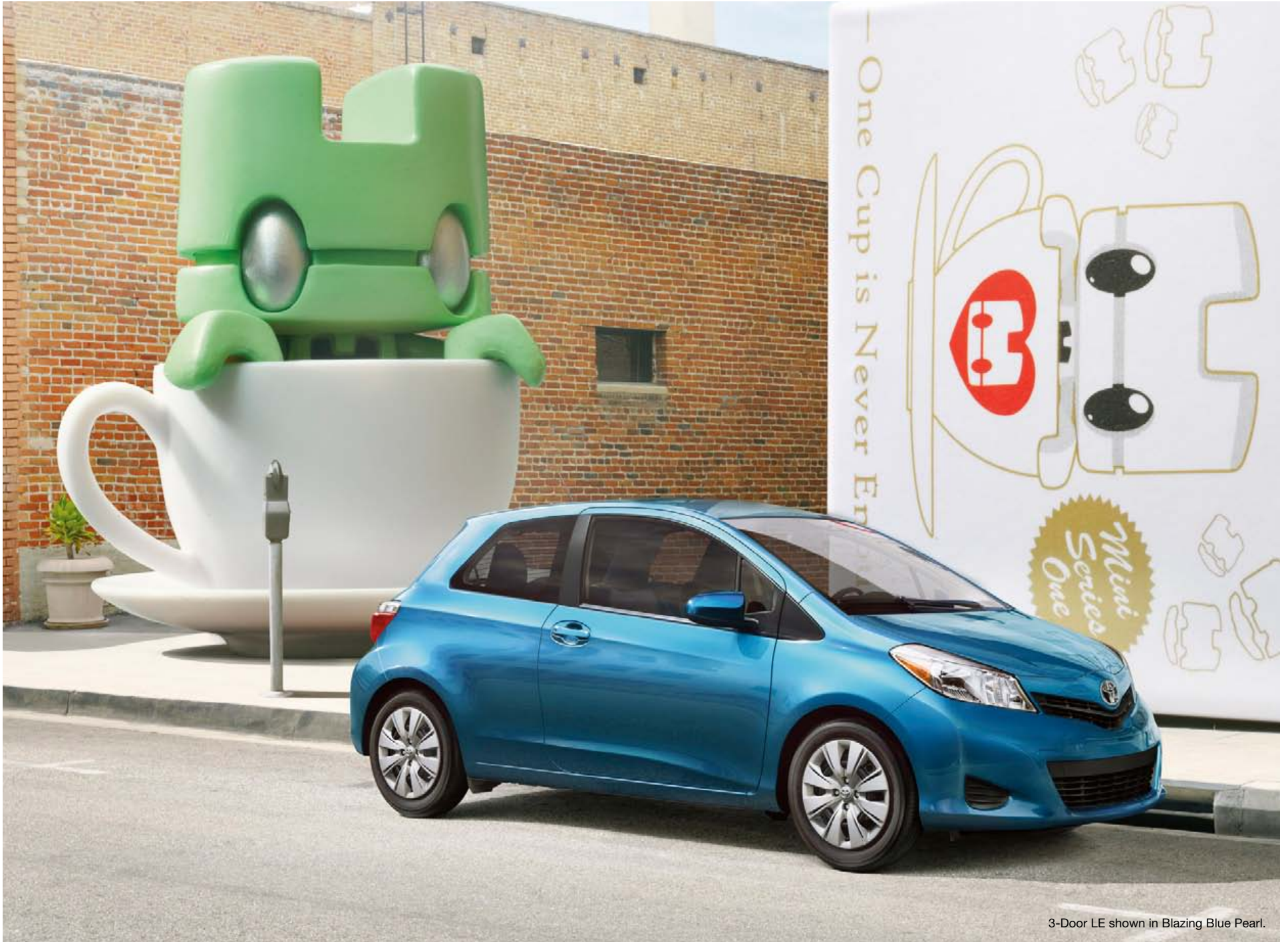
3-Door LE shown in Blazing Blue Pearl.