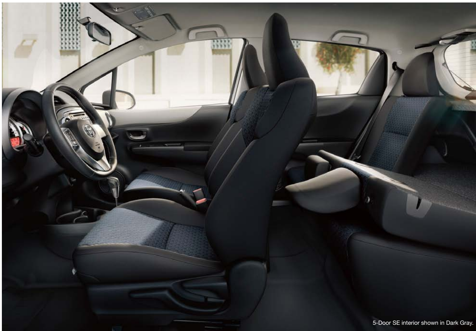
5-Door SE interior shown in Dark Gray.