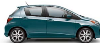
LAGOON BLUE MICA