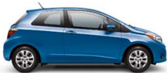
BLAZING BLUE PEARL