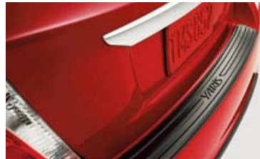
Rear bumper protector

All-weather floor mats 17 Ashtray cup Body side moldings Cargo net — envelope 1 Cargo tote 1 Carpet floor mats 17 Doorsill enhancement Emergency assistance kit