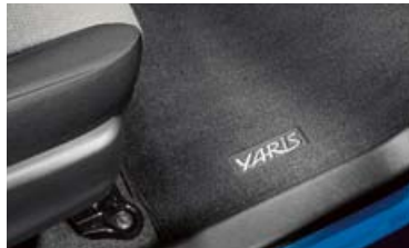
All-weather floor mats 17

A wide range of Genuine Toyota Accessories is available to help you make your Yaris your own. Considering how appealing Yaris is to begin with, these quality products will be like icing on the cake. Some accessories may not be available in all regions of the country. See your Toyota dealer for details.