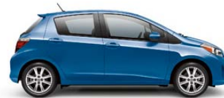
BLAZING BLUE PEARL