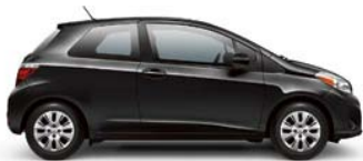
BLACK SAND PEARL