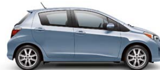
WAVE LINE PEARL