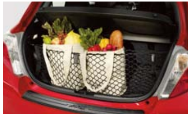
Cargo net — envelope 1