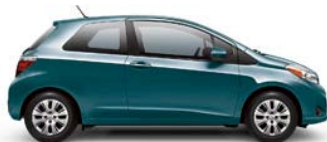
LAGOON BLUE MICA