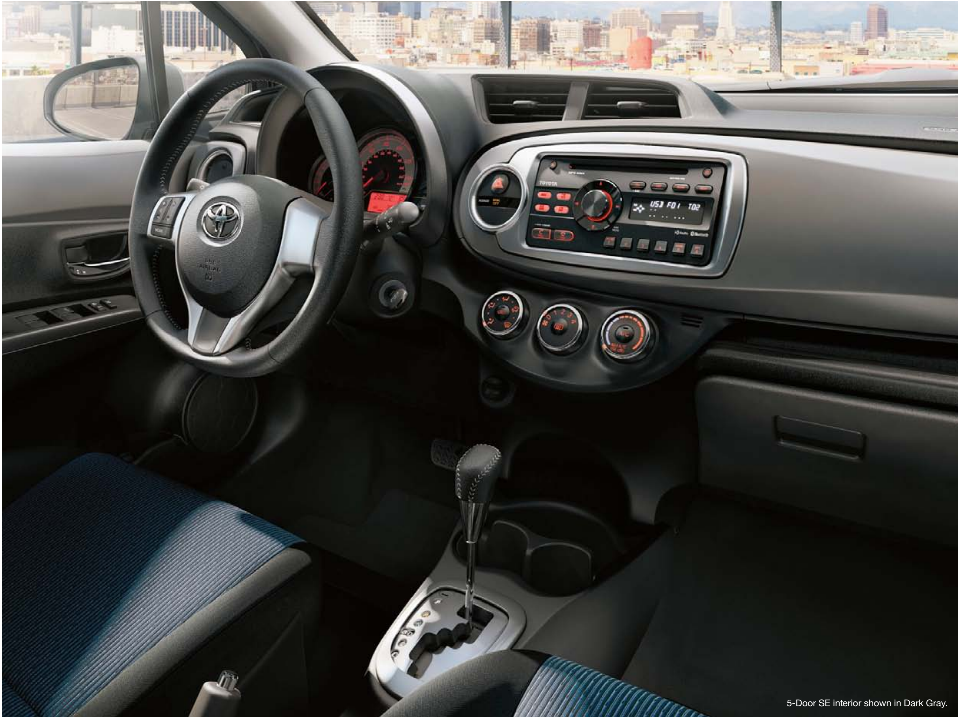
5-Door SE interior shown in Dark Gray.