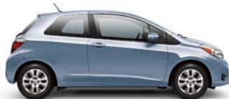
WAVE LINE PEARL