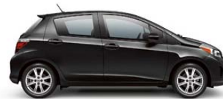
BLACK SAND PEARL