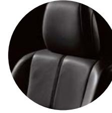
Black leather trim