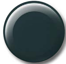
Cosmic Gray Mica