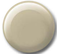
Crème Brulee Mica