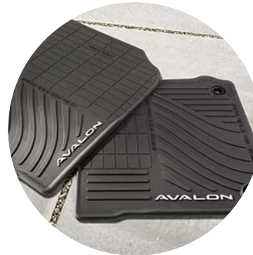
All-weather floor mats 3