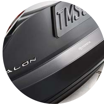
Rear bumper appliqué