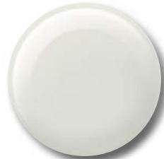
Blizzard Pearl Extra-cost color