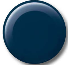
Parisian Night Pearl