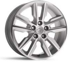
XLE and XLE Premium alloy wheel