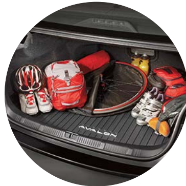
Cargo tray 2