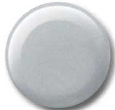
Celestial Silver Metallic