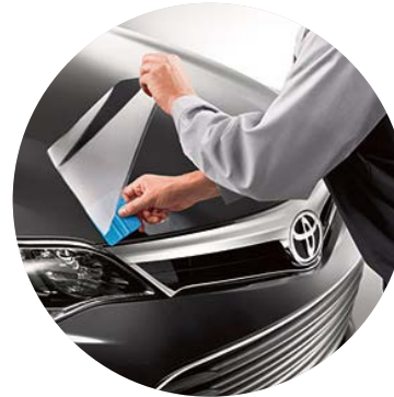
Paint protection film – hood and fenders and front bumper 1