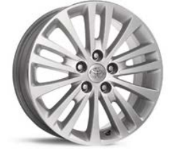
Hybrid alloy wheel