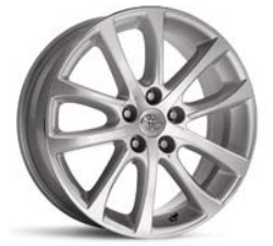
Limited alloy wheel

Plush leather options shown — Avalon offers several choices including Limited and Hybrid Limited with premium perforated leather trim.