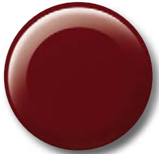
Ooh La La Rouge Mica