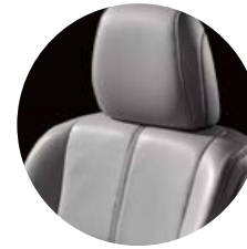
Gray leather trim