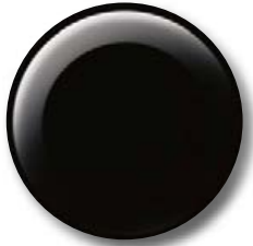
Attitude Black Metallic