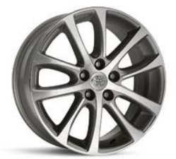
XLE Touring alloy wheel