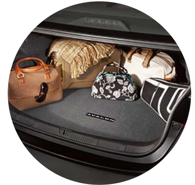
Carpet trunk mat 2