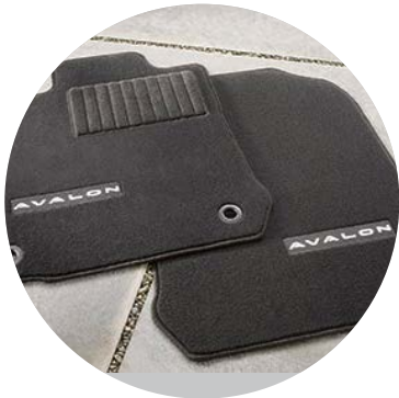
Carpet floor mats 3