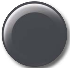
Magnetic Gray Metallic