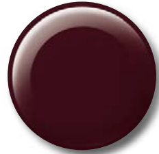
Sizzling Crimson Mica