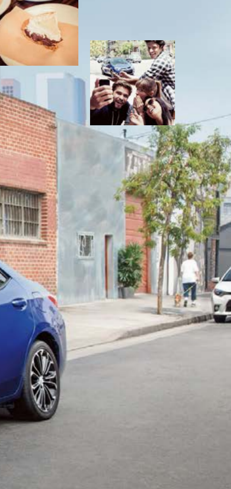
Left to right: S Plus shown in Blue Crush Metallic with available moonroof; LE Eco Premium shown in Blizzard Pearl. 1. Extra-cost color.