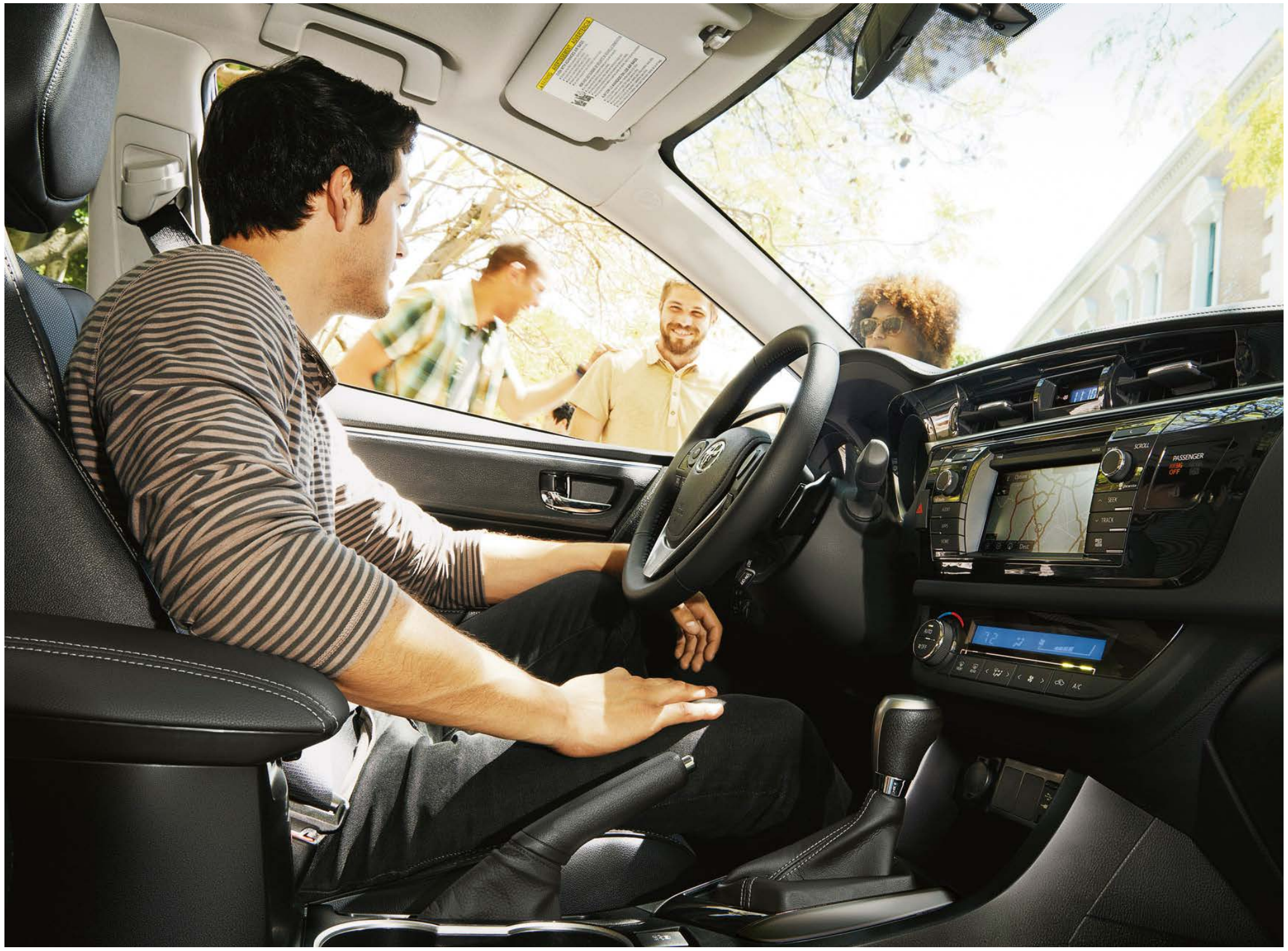
S Plus interior shown in Steel Blue mixed media with available moonroof and Driver Convenience Package.