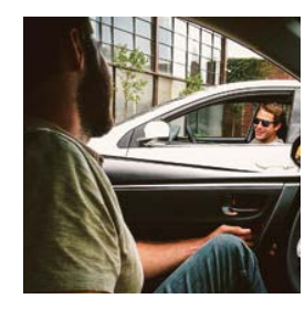
What will everyone say about your Corolla? Look at that grille, that stance and that attitude.