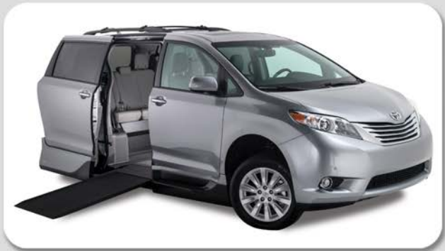
Adaptive equipment installed by mobility dealers