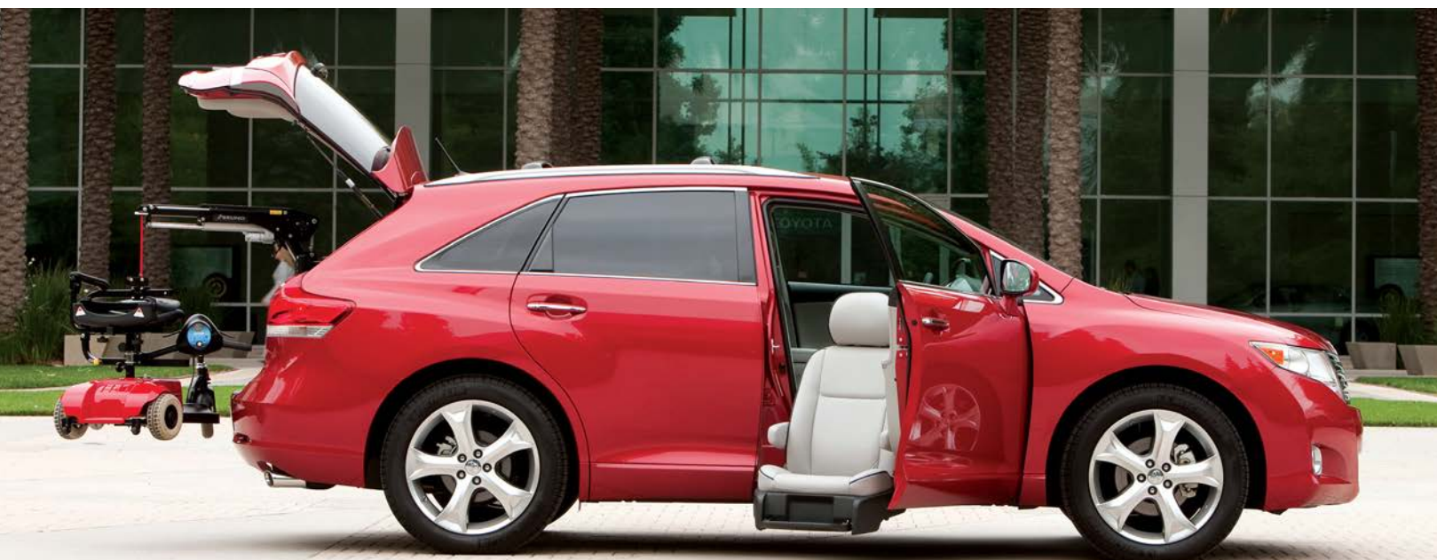
Toyota Venza shown with Bruno Curb-Sider scooter lift and Valet Limited seat.

This program provides cash reimbursement up to $1,000 to help offset the cost of any qualified adaptive equipment or conversion, for drivers and/or passengers, when installed on any eligible purchased or leased new Toyota vehicle.