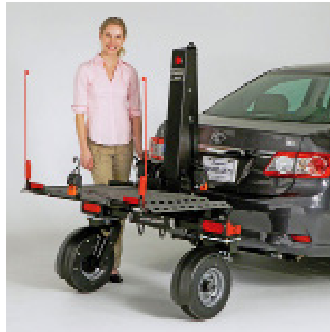
Toyota Corolla with Chariot by Bruno Independent Living Aids.

We continue our commitment to serving the needs of those with mobility challenges by providing the best mobility solutions on the market today.