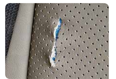
2. Burned Fabric