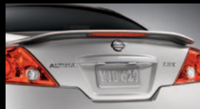
Rear Decklid Spoiler

For more information on the complete line of Genuine Nissan Accessories, go to NissanUSA.com/accessories . Or shop online at the Nissan eStore.