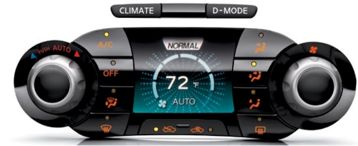
Shown in Climate Interface

Double Agent – I-CON puts you in charge of your ride style and interior comfort. In D-Mode, the system gives you the ability to rapidly adapt to changing driving conditions. With a push of the Climate button, I-CON switches displays and now becomes your control center for all things comfort.