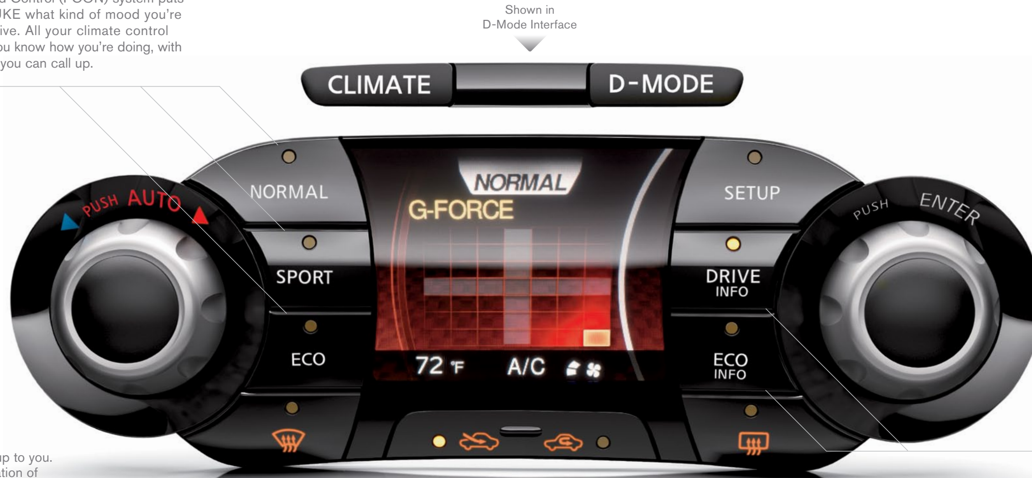
Shown in D-Mode Interface

Torque It. Boost It. Save It – In JUKE, it's up to you. Drive in Normal mode for the best combination of performance and efficiency. Want to up the ante? Lock in Sport mode and steering feel, transmission gearing and throttle response quickly adjust to make every curve count. And when it's time to slow things down, hit the Eco mode button and get the most out of every drop of fuel.