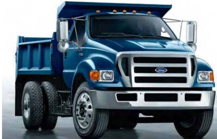
F-650/F-750 Super Duty Chassis Cabs