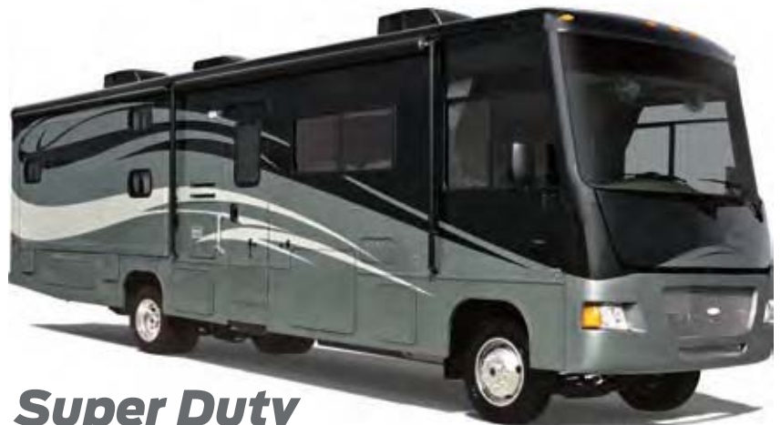
Super Duty Class A Motorhome Chassis

Note: Towing vehicle's braking system is rated for operation at GVWR – NOT GCWR. Separate functional brake systems should be used for safe control of towed vehicles or trailers weighing more than 1,500 lbs. when loaded.