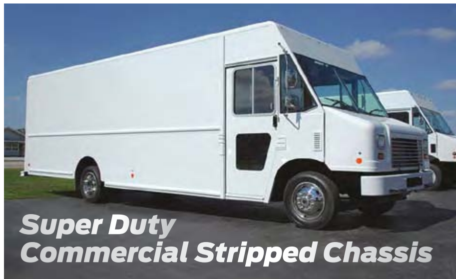
Super Duty Commercial Stripped Chassis