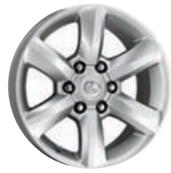
18-inch 6-spoke alloy wheels STANDARD