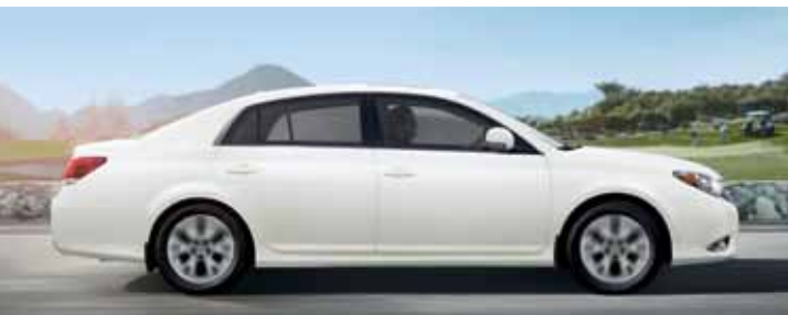
XLS shown in Blizzard Pearl.