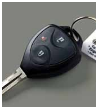
Remote Engine Starter Start your vehicle from as far as 80 feet away to cool or warm it before entry.