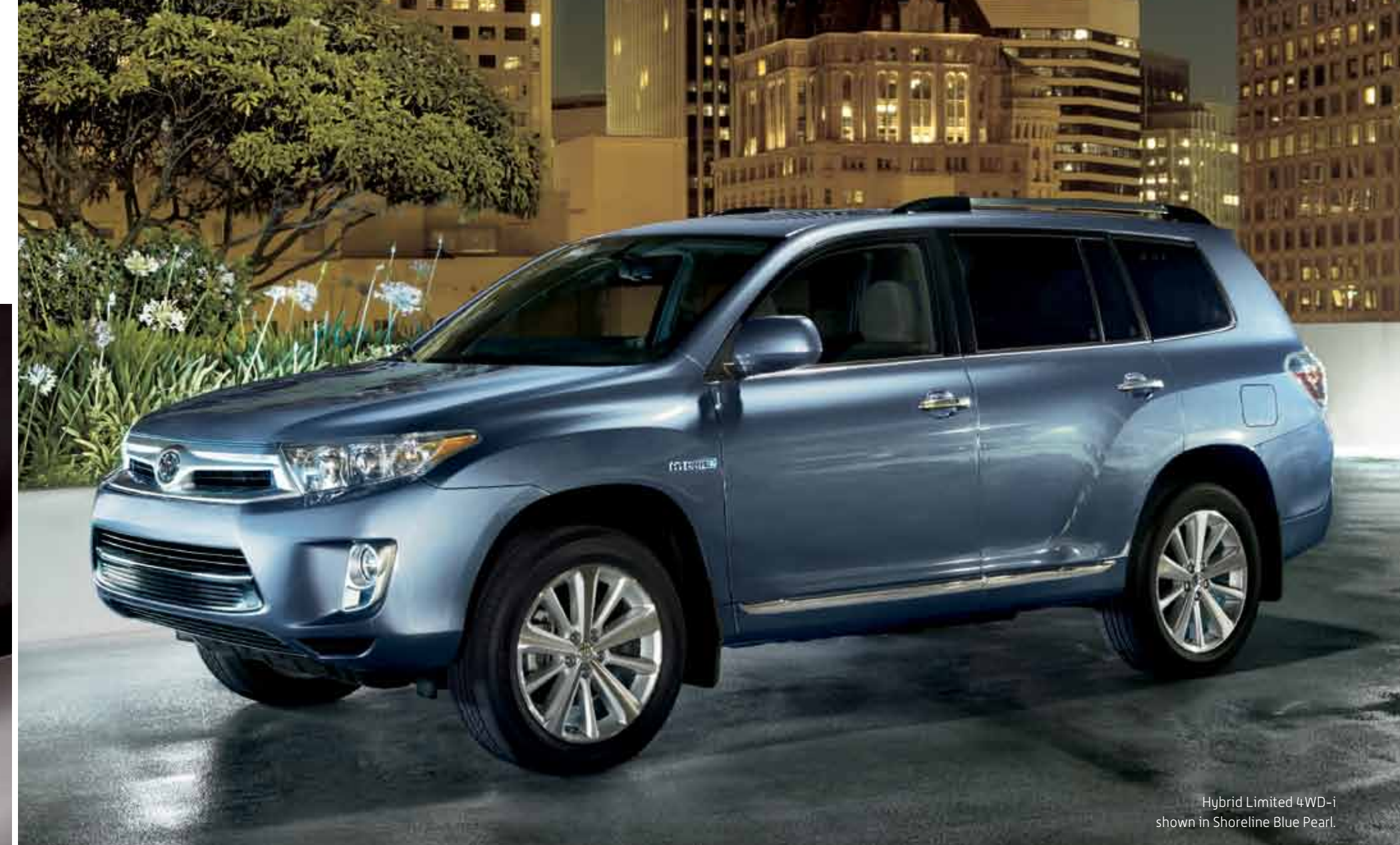
Hybrid Limited 4WD-i shown in Shoreline Blue Pearl.

TOYOTA'S HYBRID SYNERGY DRIVE combines driving pleasure with lower emissions. Toyota Hybrids produce nearly 70% fewer smog-forming emissions than typical new conventional vehicles 9 and offer economy and energy efficiency by combining gas and electric power. Toyota's Hybrid Synergy Drive automatically determines the vehicle's proper power distribution to ensure strong acceleration, a smooth response and top fuel economy.