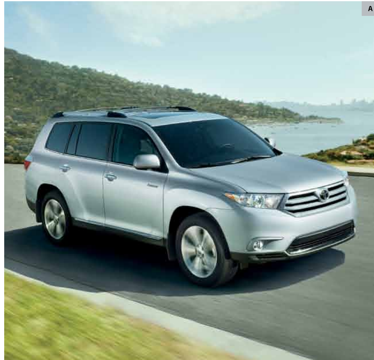
A. Highlander 4WD V6 Limited shown in Classic Silver Metallic.