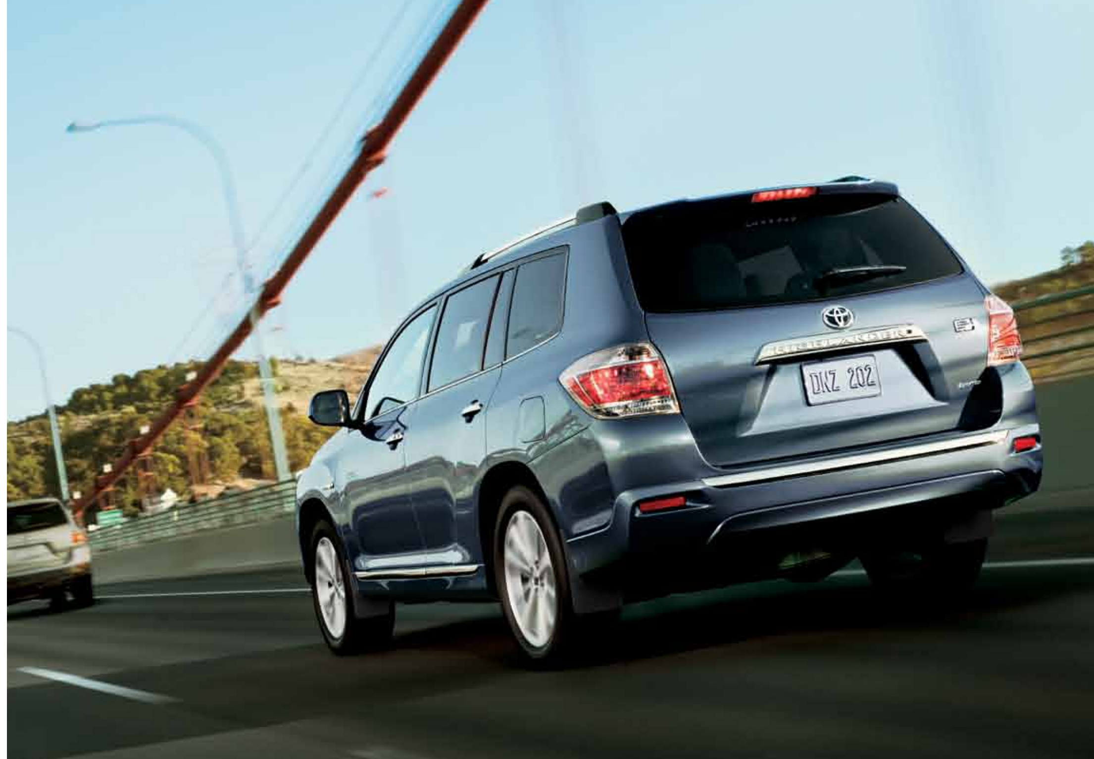
Hybrid Limited 4WD-i shown in Shoreline Blue Pearl.

The V6 gas models come standard with a 3.5 litre, 24-valve V6 engine that delivers 270 hp, and an exceptional fuel economy rating of 12.6/8.7 city/highway L/100km. 2 The Hybrid 3.5 litre 24-valve V6 engine combined with the front and rear electric motors delivers 280 hp and a fuel economy rating of 6.6/7.3 city/highway L/100km. 2