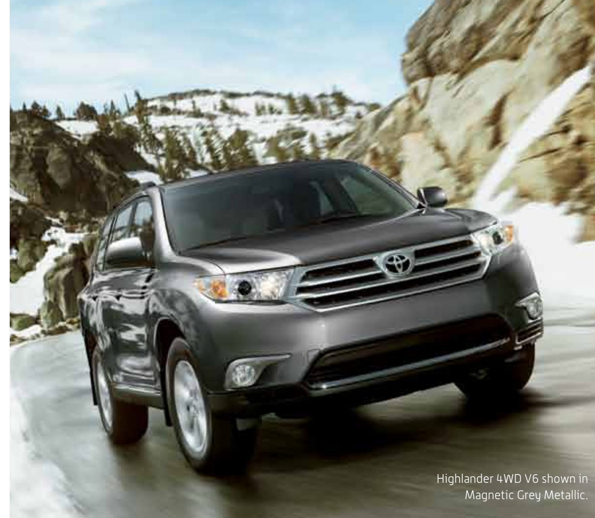
Highlander 4WD V6 shown in Magnetic Grey Metallic.

E. Lower Anchors and Tethers for Children (LATCH) are included on all outboard second-row seats.