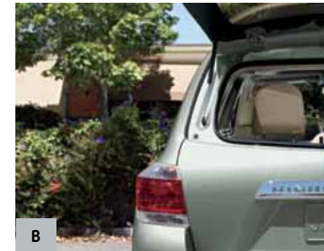
B. There are now two ways to get to all that space in the back of a Highlander. You can open just the lift-up glass hatch to load in small items, or open the whole liftgate for bulky cargo.