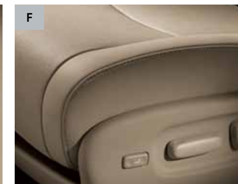
D. The ingenious Center Stow™ allows you to comfortably seat up to seven passengers. The second-row bucket seats transform into a bench seat with room for an additional passenger. E. Smart Key System with Push Button Start. F. With a push of a button on the perforated leather-trimmed seats, the driver's cushion extends for extra comfort and support (4WD V6 Limited only).