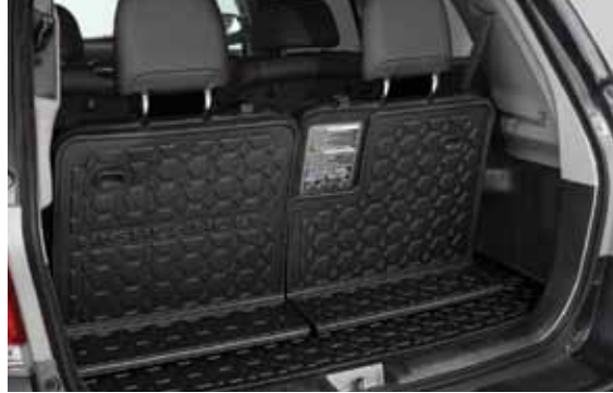
Cargo Liner Protect your interior with this durable vinyl liner which features a raised lip to contain spills for easy cleanup.