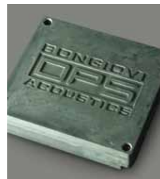
Bongiovi Acoustics DPS Digital audio processor/amplifier system to enhance your audio performance.