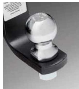
Towing Accessories Haul with confidence with a towing hitch.