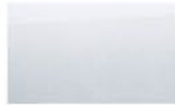
Clear White BC/BL