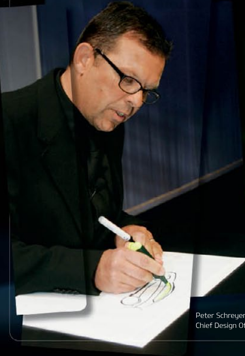
Peter Schreyer, Chief Design Officer