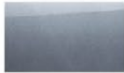
Mineral Silver (M) BC/BL