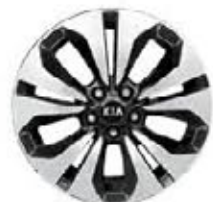
18" machined alloy sport wheels