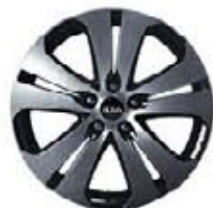
18" machined alloy wheels