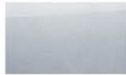
Bright Silver (M) BC/BL