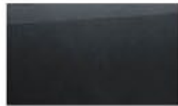
Black Cherry (P) BC/BL