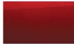
Signal Red (M) BC/BL