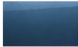
Vintage Blue (M) BC/BL