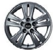
16" alloy wheels