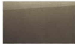
Sand Track (M) BC/BL