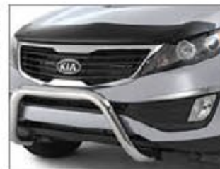
Hood deflector and push bars

Kia Genuine Parts and Accessories are engineered by Kia and installed by professionals at your Kia dealer. For more information on the full line of available Genuine Kia Parts and Accessories, see your local Kia dealer, visit www.kia.ca or call 1-877-542-2886.