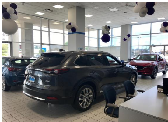
Kings Mazda Showroom, Before (Above) & During Construction

We are already in the process of planning a great grand opening celebration! More details on that in future issues.