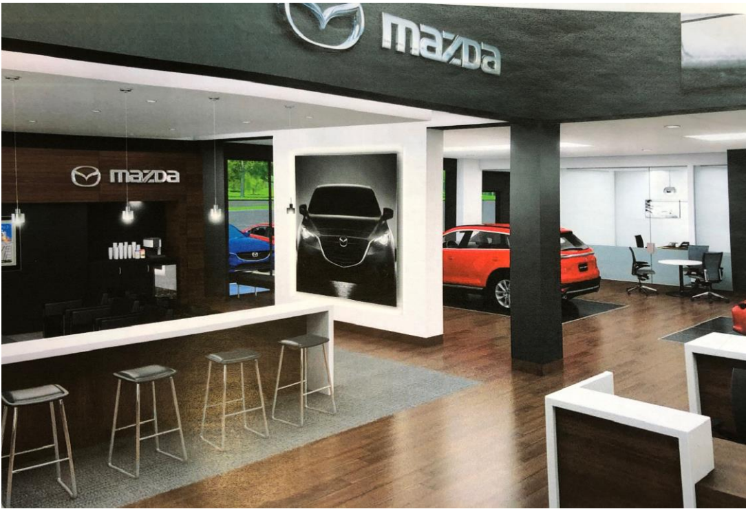
Customer Lounge Concept