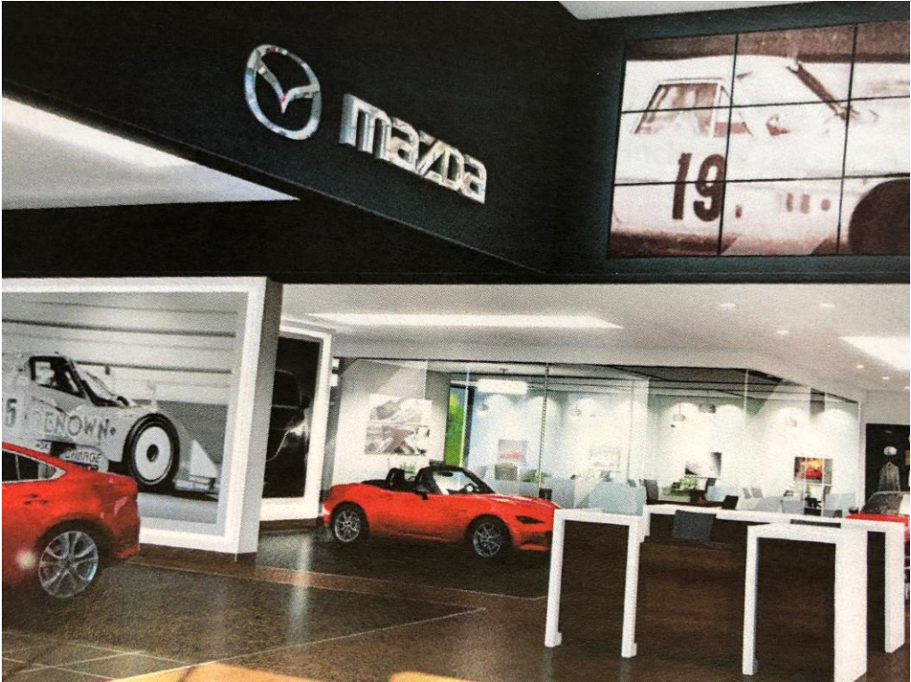
Main Entrance Concept