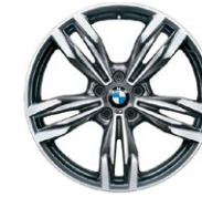
M6 Gran Coupe 20-inch Double Spoke light alloy wheels (Style 433M),* 20 x 9.5 front, 20 x 10.0 rear; and 265/35 front, 295/30 rear performance tires 3,4

20-inch Double Spoke light alloy wheels (Style 373M), 20 x 8.5 front, 20 x 9.0 rear; and 245/35 front, 275/30 rear run-flat 2 performance tires 3,4