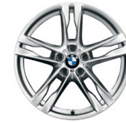
650i Gran Coupe 650i xDrive Gran Coupe

20-inch Double Spoke light alloy wheels (Style 373M), 20 x 8.5 front, 20 x 9.0 rear; and 245/35 front, 275/30 rear run-flat 2 performance tires 3,4