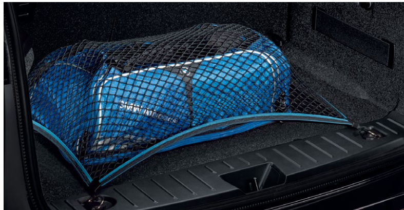
Transport Net. PN: 51 47 2 348 063 $75.00

The Transport Net is made entirely from recycled materials and stops loose objects from sliding around in the luggage compartment. Its practical hook means it is quickly ready for use.