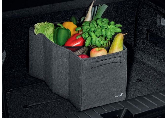
Collapsible Box. PN: 51 47 2 348 061 $85.00

The practical Collapsible Box in BMW i design is made from high-grade textile fabric recycled from PET bottles, and fits perfectly in the luggage space of the BMW i3 and BMW i8 allowing slip-safe stowing of storage items. The luggage space is also effectively protected against soiling. The simple and intelligent folding mechanism means it can be folded together to save space. When opened completely, it will fit in any shopping cart, where its two large compartments and two small key pouches keep things neat and orderly.