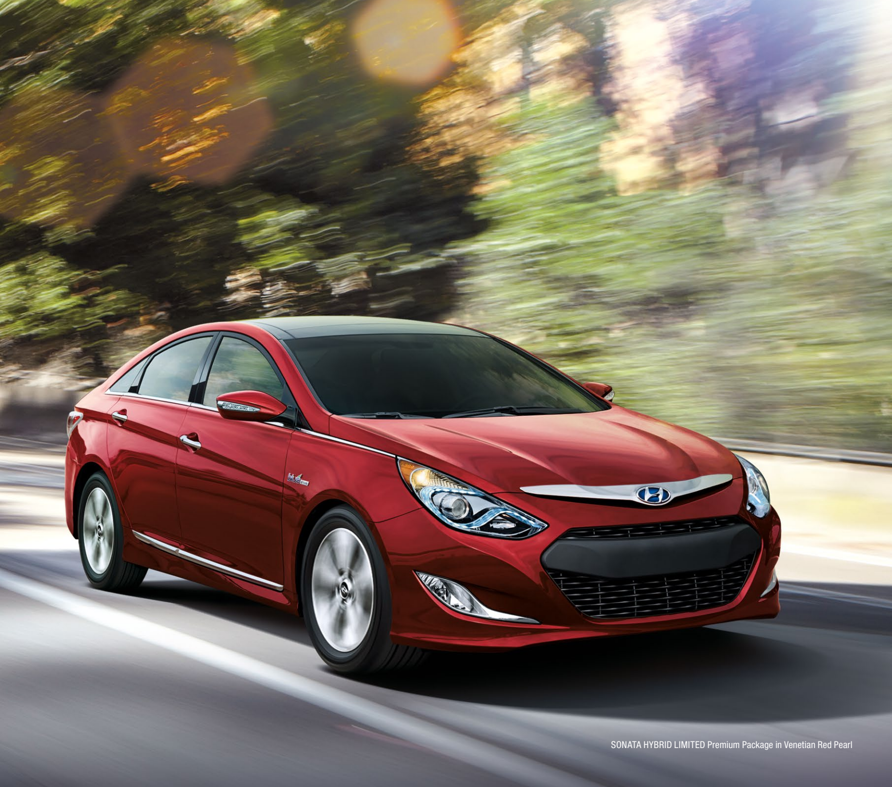
SONATA HYBRID LIMITED Premium Package in Venetian Red Pearl