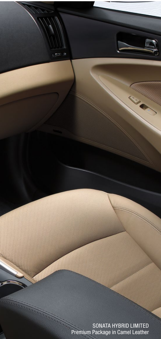
SONATA HYBRID LIMITED Premium Package in Camel Leather