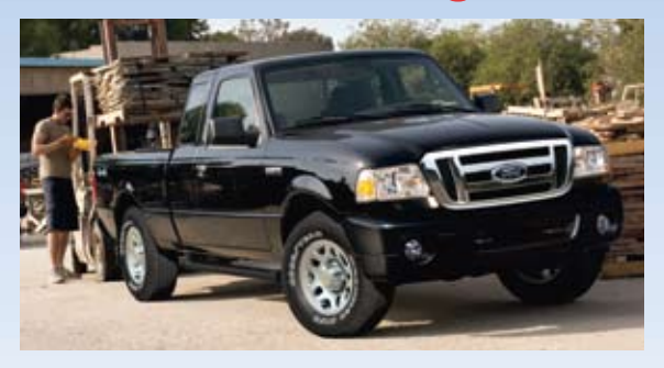
NEW for 2010 Ranger Trailer Tow Class III (a) is standard equipment on all series. AdvanceTrac <sup>®</sup> with RSC <sup>®</sup> (Roll Stability Control<sup>™</sup>) <sup>(b)</sup> and Side Seat Airbags are new and standard equipment on all series.

(a) Trailer Tow Class III capable with V6 engine only.