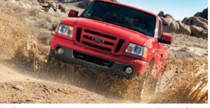
Note: Certain states require electric trailer brakes for trailers over a specified weight. Be sure to check state regulations for this specified weight. The maximum trailer weights listed may be limited to this specified weight, as the Ranger's electrical system does not include the wiring connector needed to activate electric trailer brakes.