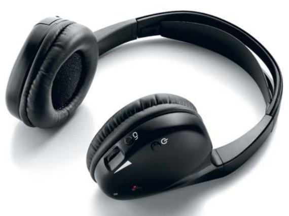
White Fire Headphones Enjoy this additional set of headphones for your Land Rover rear seat entertainment system. LR038817

Mount your iPad to this Land Rover-branded holder that attaches to the Range Rover headrest posts and features a quick-release design. Your iPad can be displayed in either a portrait or landscape format, and the holder allows easy access to all ports and controls. Style 1 (fits iPad 1) — VPLVS0164 Style 2 (fits iPad 2 onward) — VPLVS0165