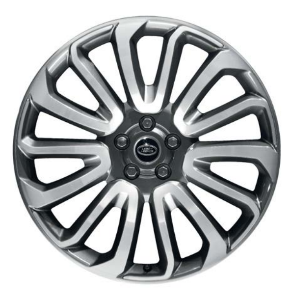
22-inch 7-Split-Spoke Alloy Wheel (Rim only) Vibration Polished Technical Gray Finish — LR039141

20-inch 5-Split-Spoke Alloy Wheel (Rim only) Shadow Chrome Finish — LR039142