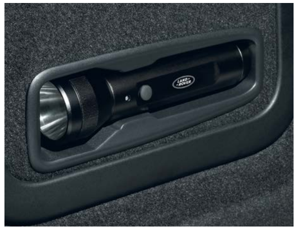
Rechargeable Flashlight To assist you when unexpected circumstances arise. VPLVS0174