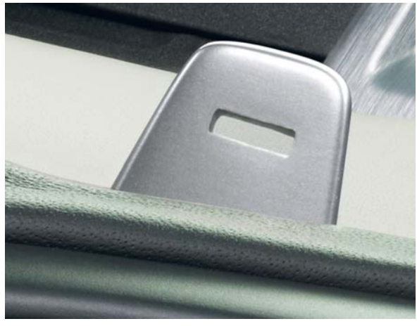
NEW - Gearshift Paddles - Aluminium Gearshift Paddles offered in high grade aluminium which is machine polished, anodised and hand brushed to provide exceptional wear resistance with a premium finish. Billet machined from solid aluminium. VPLVS0187MMU