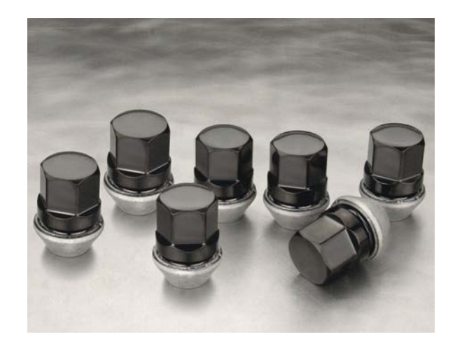
Wheel Lug Nuts High Gloss Black (Set of 20) — VPLWW0078