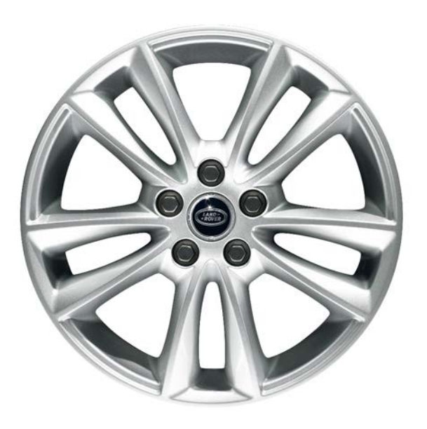
19-inch 5-Split-Spoke Alloy Wheel (Rim only) Sparkle Silver Finish — LR037742

Complement your Range Rover's appearance with a set of stunning alloy wheels. Designed and engineered to reaffirm the Range Rover aura, they provide the perfect finishing touch for your extraordinary vehicle.