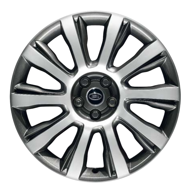
21-inch 10-Spoke Alloy Wheel (Rim only) Diamond Turned Finish — LR038149