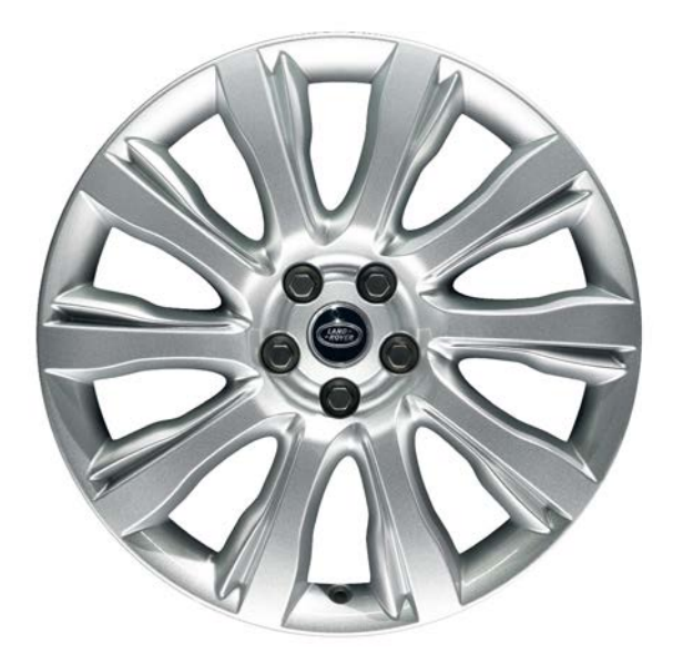
21-inch 10-Spoke Alloy Wheel (Rim only) Sparkle Silver Finish — LR037746