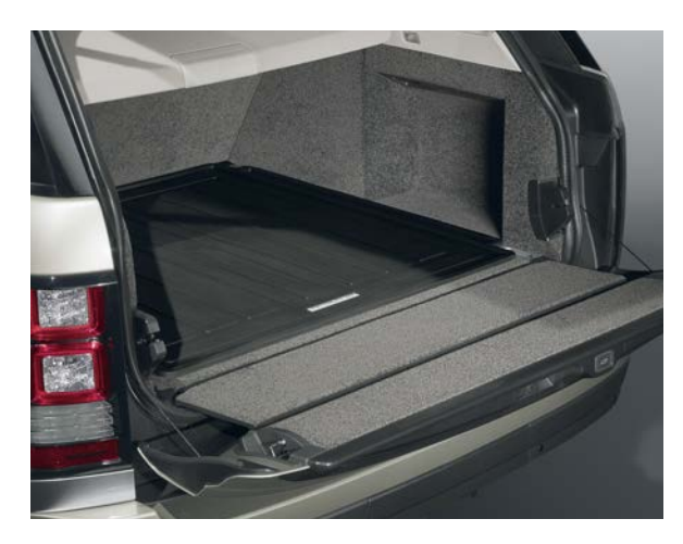
Loadspace Rubber Mat With its non-slip surface, this waterproof Range Roverbranded mat helps protect the loadspace carpet from dirt and other debris. (Requires D Ring removal from Loadspace Rails.) VPLGS0151