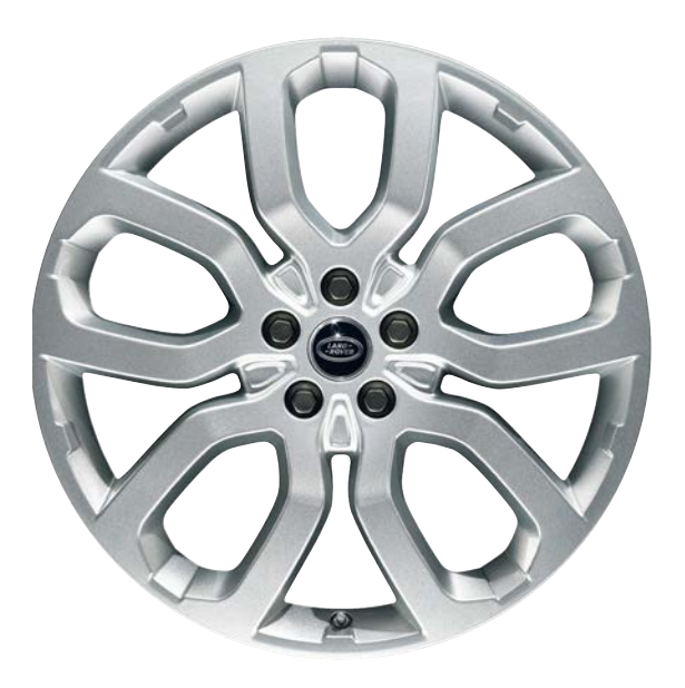
22-inch 5-Split-Spoke Alloy Wheel (Rim only) Sparkle Silver Finish — LR037747