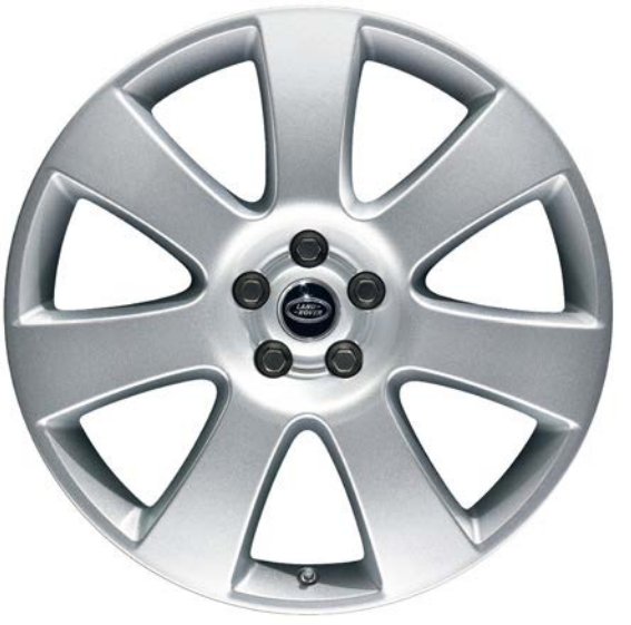
22-inch 7-Spoke Alloy Wheel (Rim only) Sparkle Silver Finish — LR038150

Enhance your Range Rover's traction on snowy or icy surfaces. Available for 19-inch, 20-inch and 22-inch wheels. LR005737