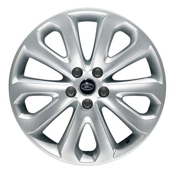
20-inch 5-Split-Spoke Alloy Wheel (Rim only) Sparkle Silver Finish — LR037745