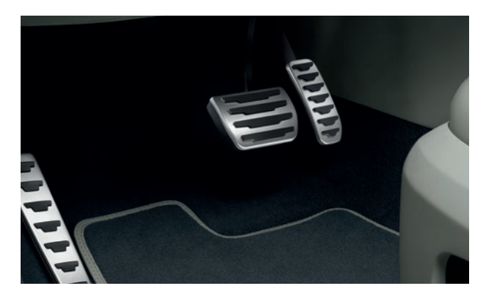
Stainless Steel Sports Pedals VPLHS0044 – Automatic Transmission vehicles

Front pair of Brushed Finish Treadplates to add style to your vehicle and protect the sill trim from scuffs and scrapes. Please contact your Land Rover Retailer for part number information.