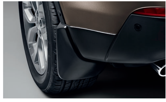
Rear Mudflaps VPLCP0204 VPLCP0205<sup>a</sup> Mudflaps to reduce spray and help protect paintwork.