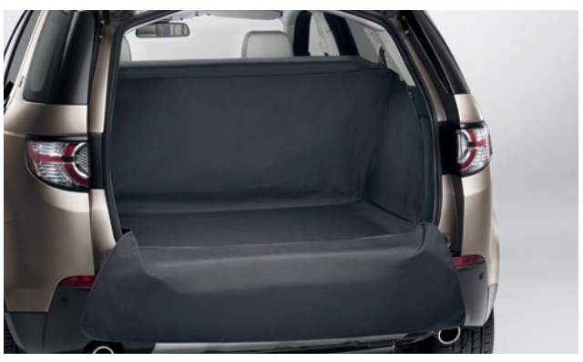
Flexible Loadspace Liner VPLCS0272

This liner provides superior protection to the loadspace floor and side wall carpets from dirty or wet equipment.