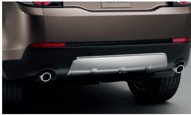
Stainless Steel Rear Undershield** VPLCP0213

The off-road styled undershield features a premium bright polished finish for the front of the vehicle.