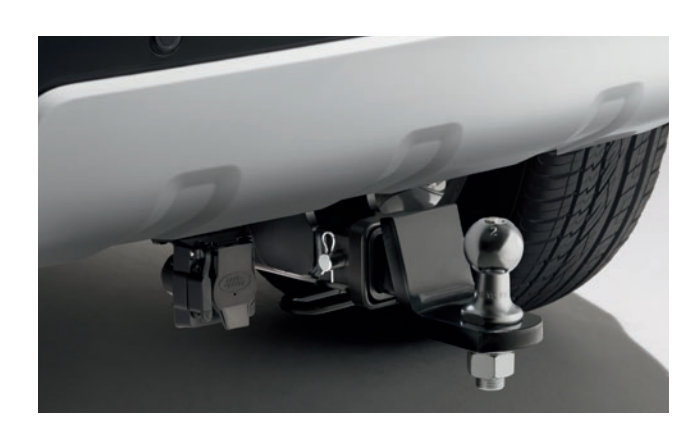
Fixed Tow Bar<sup>††</sup> VPLCT0141

Fixed position tow bar tows a trailer up to 2,500kg load capacity.