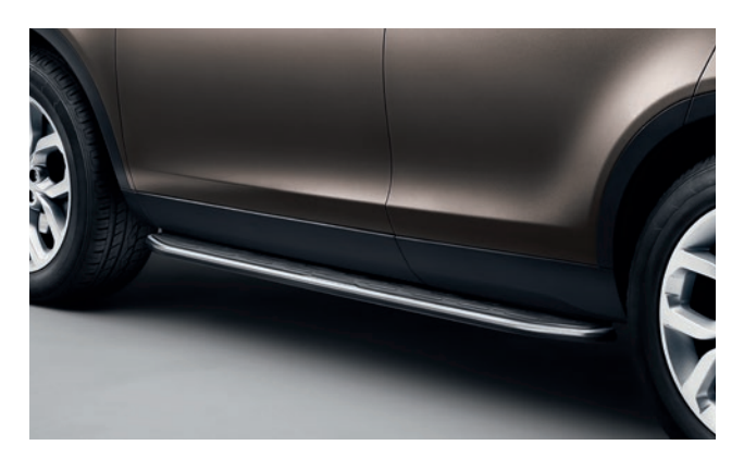
Side Steps* VPLCP0210

The side steps aid entry and exit to the vehicle and improve access to the roof. Design features include bright stainless steel edge trim and a rubber tread mat.