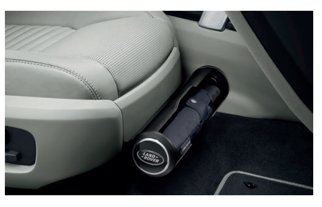
Cabin Umbrella Holder VPLCS0294

Easy to install or remove these sun blinds provide increased comfort helping to protect passengers from heat and glare of the sun. Three versions available for the second row, third row passenger side windows and the rear tailgate.