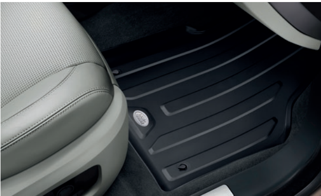
Rubber Floor Mats VPLCS0281 – Front and second row VPLCS0280 – Third row (not shown) Rubber footwell mats help provide protection from general dirt.