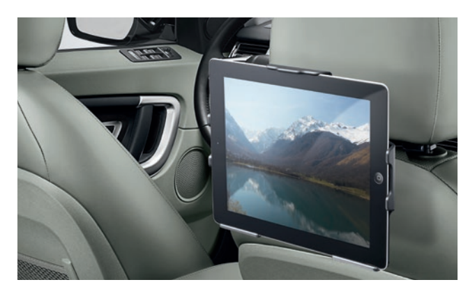
iPad® Holder VPLVS0165 – iPad®* VPLVS0164 – iPad® 1

Convenient coat hanger attaches to the head restraint posts.