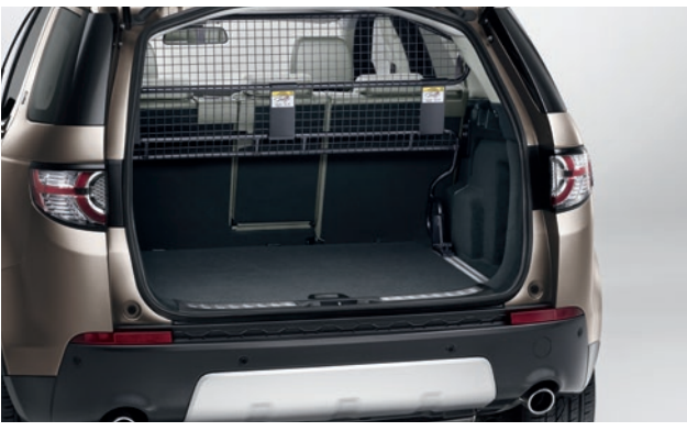
Luggage Divider – Half Height* VPLCS0300

The Luggage Divider is designed to prevent cargo from entering the passenger compartment. It incorporates a useful integral ski hatch that allows longer items to be carried where a suitable rear seat option is fitted. The design of the luggage divider has been optimized to second row seating featuring tilt functionality.