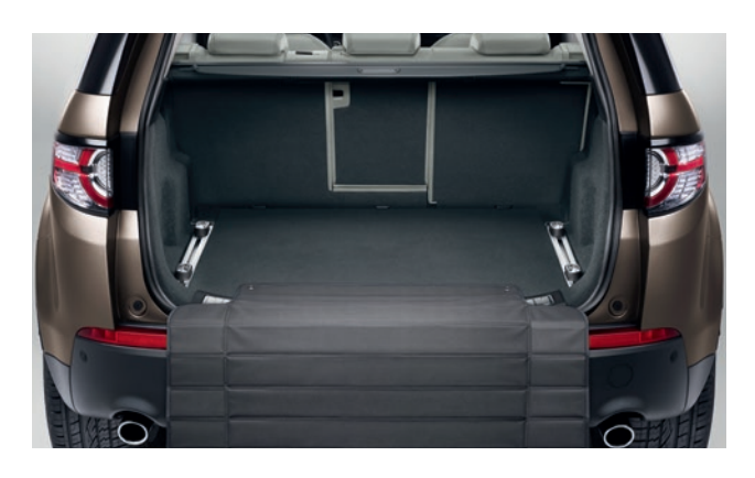
Rear Bumper Protection Cover VPLVS0179

The Loadspace Retention Net utilizes loadspace tie-down points to prevent items from moving when driving. Includes floor net and two ratchet straps.