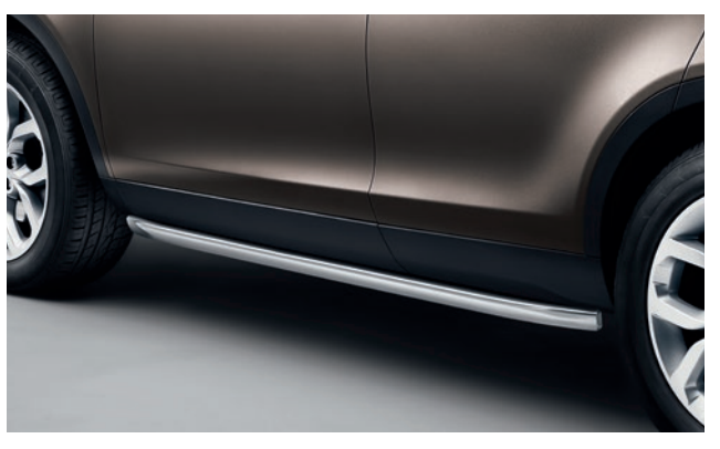
Side Tubes* VPLCP0209

The side steps aid entry and exit to the vehicle and improve access to the roof. Design features include bright stainless steel edge trim and a rubber tread mat.