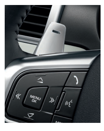
Gearshift Paddles VPLVS0187MMU – Aluminum VPLVS0187CAY – Aluminum Red

Provides secure mounting for your iPad ^{\circ} . Rear seat facing, attaches to the head restraint posts.