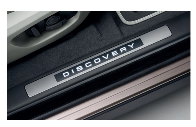
Illuminated Treadplates VPLCS0286LAA – Lunar VPLCS0286PVJ – Ebony (not shown)

This convenient drink and food cabinet is ideal for use on long journeys and also provides a comfortable rear center armrest with a premium leather finish.