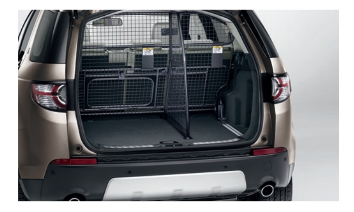
Luggage Divider – Full Height* VPLCS0299

Luggage Divider – Loadspace Partition* VPLCS0301