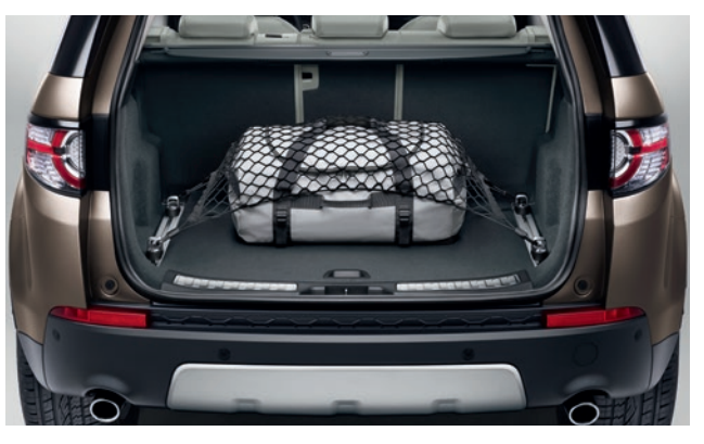
Loadspace Retention Net VPLCS0269

The Aperture Retention Net keeps loads secure when tailgate is opened and maximizes packing space.