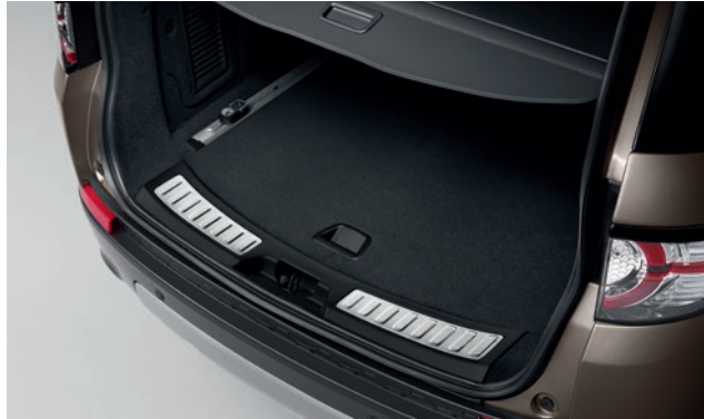
Rear Loadspace Treadplate Finisher VPLCS0287LAA – Lunar VPLCS0287PVJ – Ebony (not shown)

Provides protection to the bumper paintwork while loading and unloading.