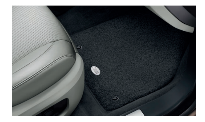
Premium Carpet Mats VPLCS0282LAA – Lunar VPLCS0282PVJ – Ebony (not shown) Deep pile 2,050g weight carpet mats with waterproof backing.