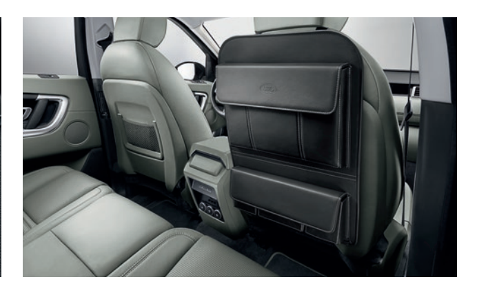
Seat Back Stowage VPLVS0182 – Premium VPLVS0181 – Standard (not shown)

Complete the look and feel of your steering wheel with premium aluminum paddles. Gearshift Paddles are machine polished, anodized and hand brushed to provide exceptional wear resistance with a premium finish.