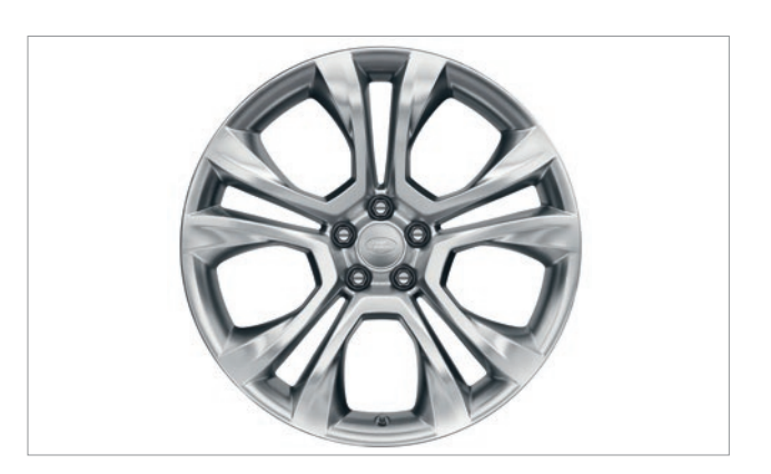
20 inch five split-spoke 'Style 524' VPLCW0105

The off-road styled undershield features a premium bright polished finish for the rear of the vehicle.