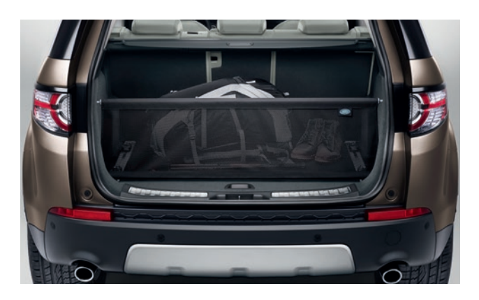
Aperture Retention Net VPLCS0267

The Aperture Retention Net keeps loads secure when tailgate is opened and maximizes packing space.