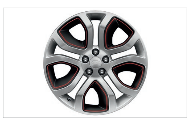
19 inch five split-spoke 'Style 523' VPLCW0104

Manufactured from stainless steel with a highly polished finish. The rugged off-road appearance complements the vehicle's exterior design.