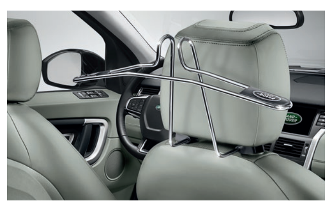
Coat Hanger VPLCS0276

Designed to take a wide range of compact umbrellas, this product fits discretely under the front passenger seat.