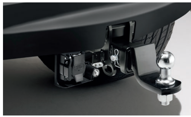
Fixed Tow Bar<sup>††</sup> VPLCT0143

Offered for vehicles equipped with 5+2 seating and reduced section spare wheel.