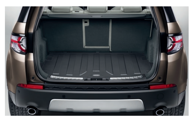
Loadspace Mat – Rubber VPLCS0279

The Luggage Divider is designed to prevent cargo from entering the passenger compartment. The design of the luggage divider has been optimized to second row seating featuring tilt functionality.