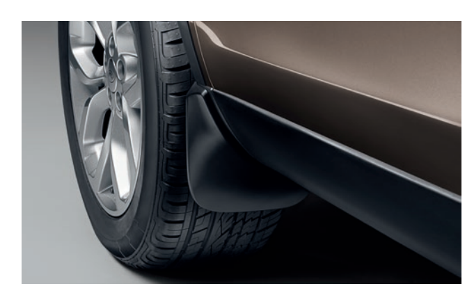
Front Mudflaps VPLCP0203 Mudflaps to reduce spray and help protect paintwork.