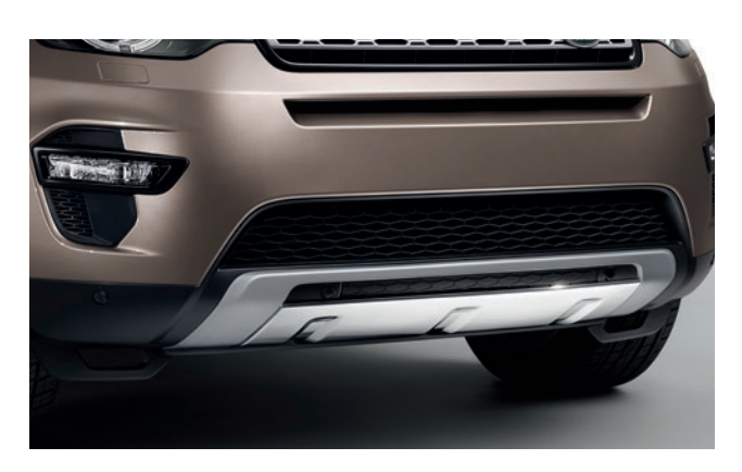
Stainless Steel Front Undershield VPLCP0212

With ceramic finish, contrasting Gloss Black inner spokes and a laser etched red pinstripe.