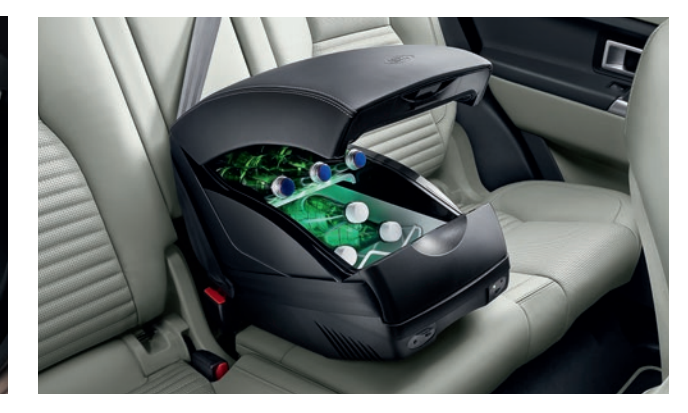
Center Armrest Cooler/Warmer Box VPLVS0176

This convenient drink and food cabinet is ideal for use on long journeys and also provides a comfortable rear center armrest with a premium leather finish.