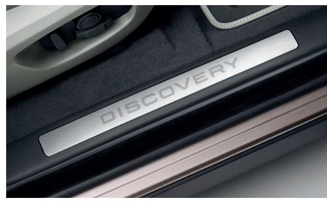
Brushed Finish Treadplates Lunar Ebony (not shown)

Dealer-fit treadplates featuring illuminated Discovery script. Supplied as a pair for driver and front passenger sides of the vehicle to welcome you into the cabin.