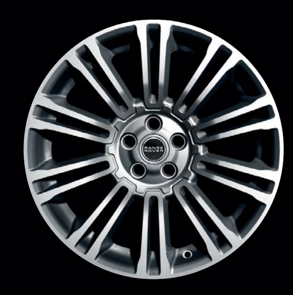
19–inch Alloy Wheel (Rim only) Diamond Turned Finish — LR028119