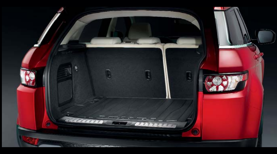
Loadspace Rubber Mat Protects floor from dirt. Waterproof with retaining lip and non-slip surface. Compatible with Cargo Barrier. VPLVS0091

Half-Height Cargo Barrier (not pictured) Range Rover Evoque models — VPLVS0145 Range Rover Evoque Coupe models — VPLVS0144