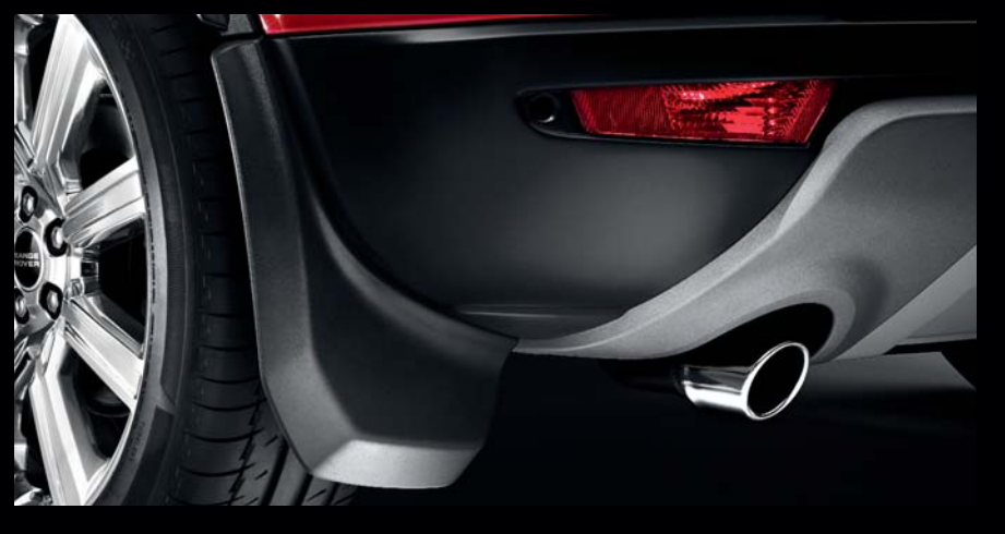
Rear Mudflaps Pure and Prestige models — VPLVP0069 Dvnamic models — VPLVP0070

Help reduce road spray and protect your Evoque's paint finish with these custom-designed mudflaps. Pure and Prestige models — VPLVP0065 Dynamic models — VPLVP0066