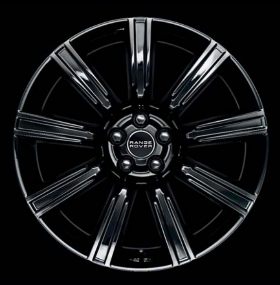
20-inch Alloy Wheel (Rim only) Gloss Black Finish — VPLVW0071

Add a striking personal touch to your new Evoque with stunning alloy wheels. Choose from a trio of attractive designs as well as available wheel nuts, valve stem caps, and more — all meticulously engineered and tested to rigorous Land Rover standards.