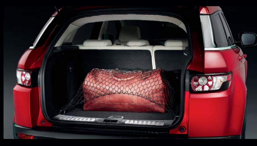
Luggage Retention Net Help keep items from shifting in the loadspace during your travels. Requires Loadspace Luggage Floor Rails (VPLVS0102) — sold separately. VUB503130