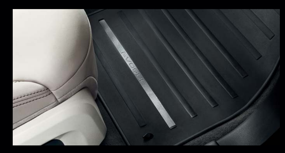
Rubber Mat Set Shield the floor of your Evoque from water, mud and other debris with durable rubber mats. VPLVS0124PVJ

Keep your vehicle's passenger compartment cooler while protecting it from UV sunray exposure with this lightweight Windshield Interior Sunshade. VPLVS0163