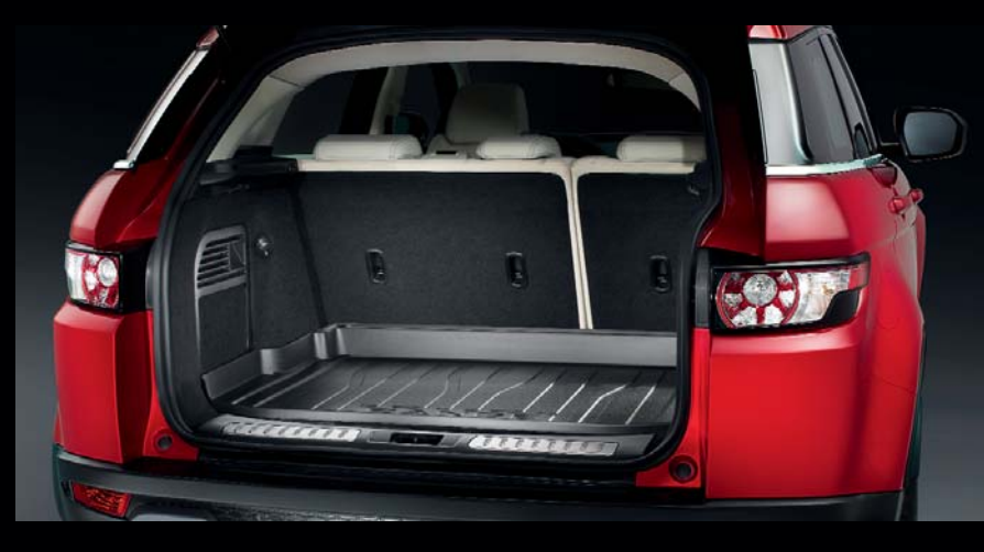
Rigid Loadspace Protector Offers easy access to tie-down points where fitted. Not compatible with the Full Height Cargo Barrier. VPLVS0089

Firmly hold luggage in place during transport. Standard on the Evoque Prestige and Dynamic models. Not standard on the Evoque Pure model. Can be used with the Luggage Retention Net (page 7) or Luggage Retention Kit (page 9), all sold separately. Note: Requires Luggage Retention Kit (VPLVS0125). VPLVS0102