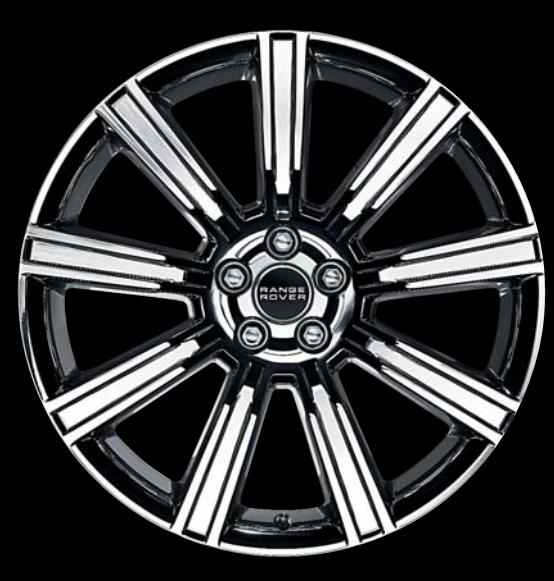
20-inch Alloy Wheel (Rim only) Polished Finish — LR024426