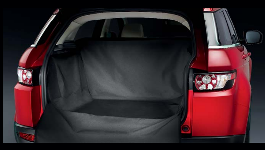
Flexible Loadspace Protector VPLVS0090