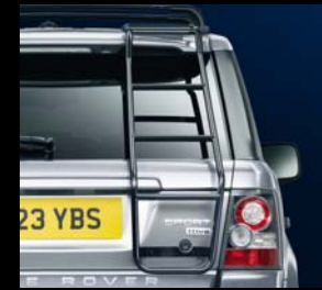
Rear Ladder (2005-11 vehicles only) AGP790020

For vehicles with Roof Rails. Fitting Kit (VUB504230) is required. Load capacity: 119 lbs. CAB5000130PMA