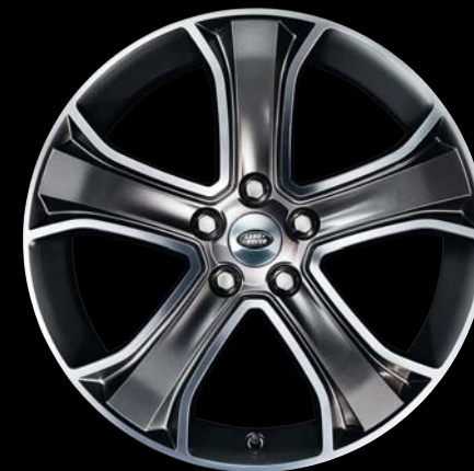
20-inch 9.5J 5-Spoke Alloy Wheel (Rim only) Diamond Turned Finish — LR017280 2010 vehicles onward