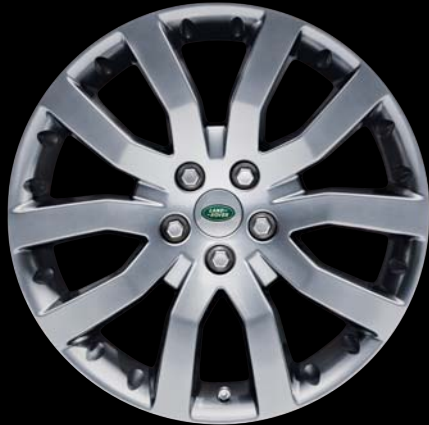
20-inch 9.5J 10-Spoke Alloy Wheel (Rim only) Shadow Chrome Finish — LR008742 Sparkle Silver Finish — RRC500681MNH