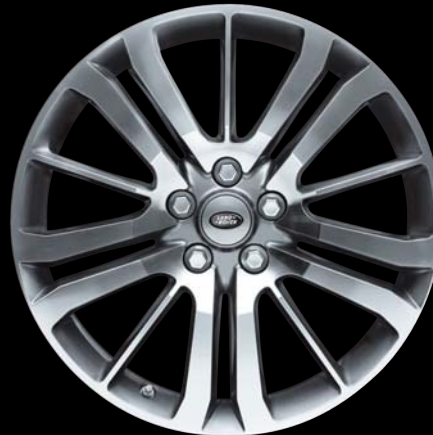
20-inch 9.5J 15-Spoke Alloy Wheel (Rim only) Diamond Turned Finish — LR008549