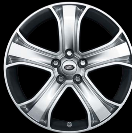
20-inch 9.5J 5-Spoke Alloy Wheel (Rim only) Sparkle Silver Finish — LR017281 2010 vehicles onward

The alloy wheel designs are the same for both part numbers. However, LR008742 has a Shadow Chrome Finish and RRC500681MNH has a Sparkle Silver Finish. Both fit 2010MY and pre-2010MY vehicles.