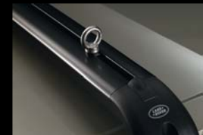
Lashing Eye Kit Six additional tie-down points for use with T-slots on Crossbars. VUB503160

*Roof Rails and Crossbars are required for all Land Rover roof-mounted accessories. Objects placed above the roof-mounted satellite antenna may reduce the quality of the signal received by the vehicle and could have a detrimental effect on the navigation and satellite radio systems, if fitted.