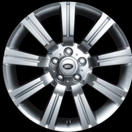
20-inch 9.5J Stormer Alloy Wheel (Rim only) Titan Silver Finish — RRC503820MCM

Nothing quite sets your Range Rover Sport apart like a stylish set of alloy wheels. Choose from several distinctive designs.