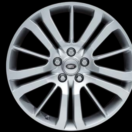
20-inch 9.5J 15-Spoke Alloy Wheel (Rim only) Sparkle Silver Finish — LR008548