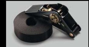
Ratchet Strap Secure items to the Luggage Carrier, Crossbars or Expedition Roof Rack with a Ratchet Strap. CAR500010