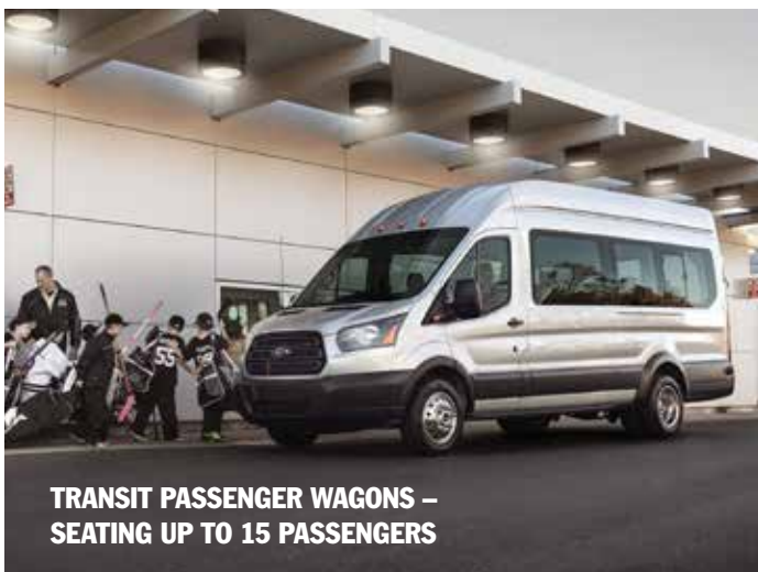
TRANSIT PASSENGER WAGONS – SEATING UP TO 15 PASSENGERS