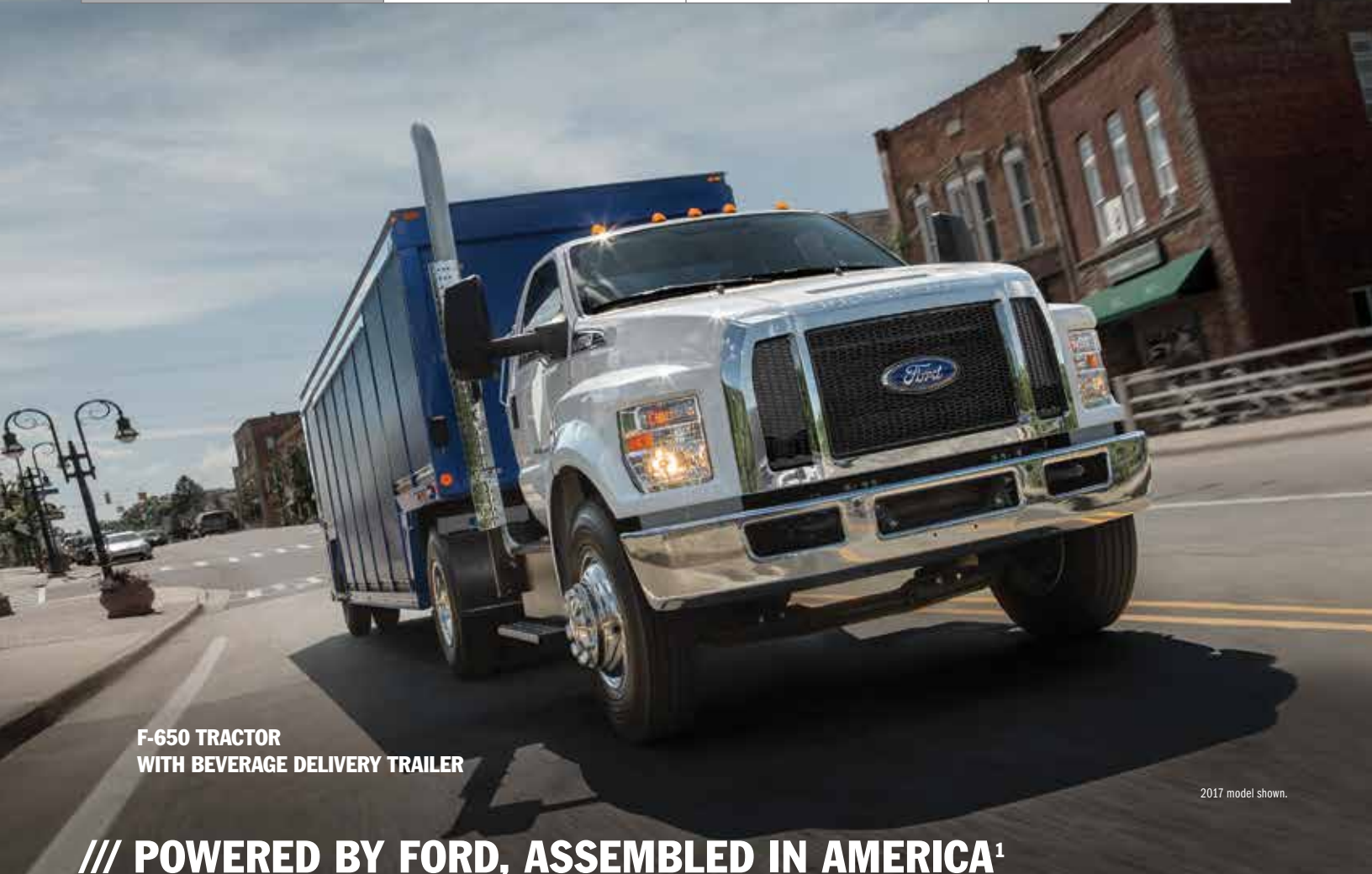
F-650 TRACTOR WITH BEVERAGE DELIVERY TRAILER