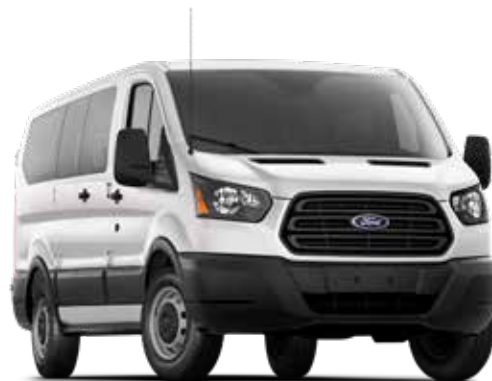
TRANSIT PASSENGER WAGONS

THE ULTIMATE PEOPLE MOVER FOR YOUR BUSINESS INCLUDES AN IMPRESSIVE SELECTION OF ENGINES, ROOF HEIGHTS, WHEELBASES AND SMART TECH FEATURES.