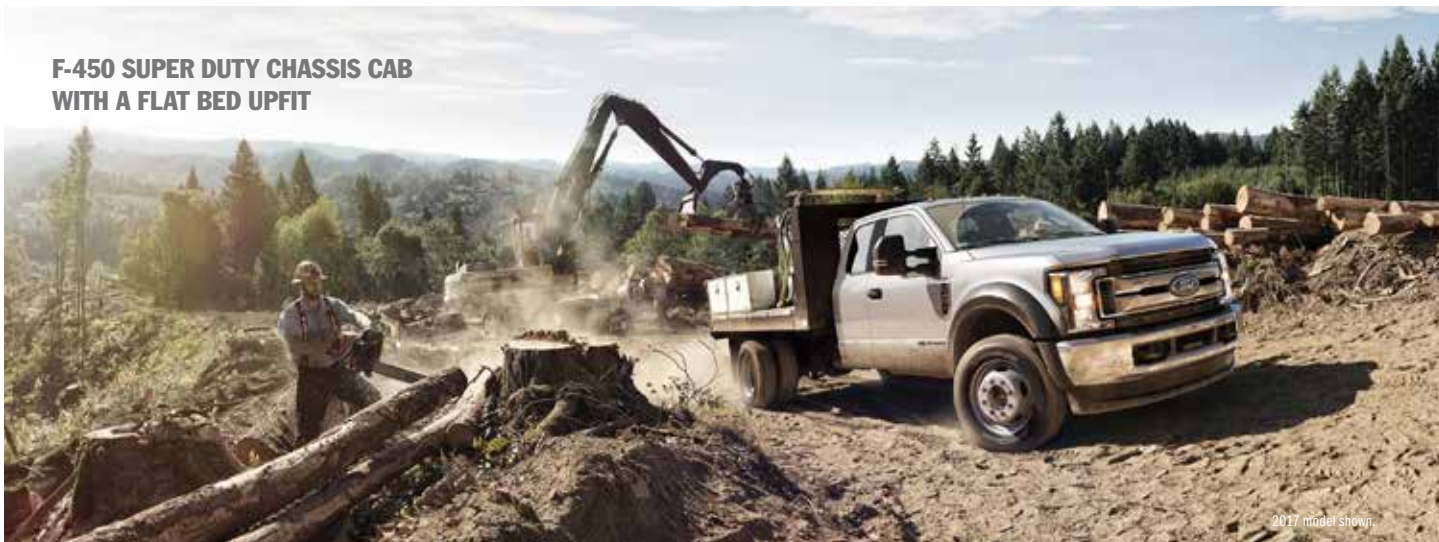
2017 model shown.