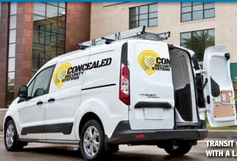
TRANSIT CONNECT CARGO VAN WITH A LADDER RACK UPFIT

TRANSIT CONNECT OFFERS AMPLE INTERIOR ROOM TO CUSTOMIZE IT WITH MANY UPFIT PACKAGES. VISIT FORD.COM/TRANSITUPFITS FOR DETAILS.