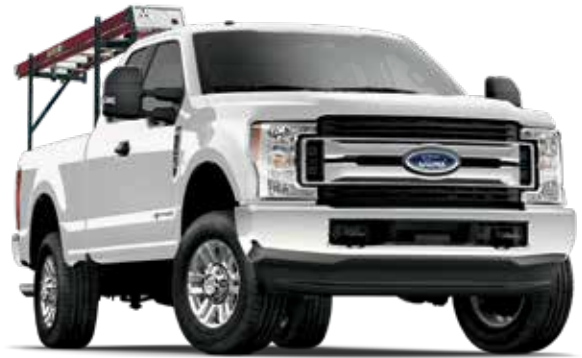
2017 model shown.