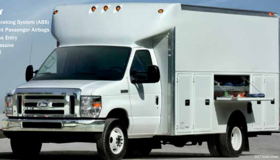
2017 model shown.