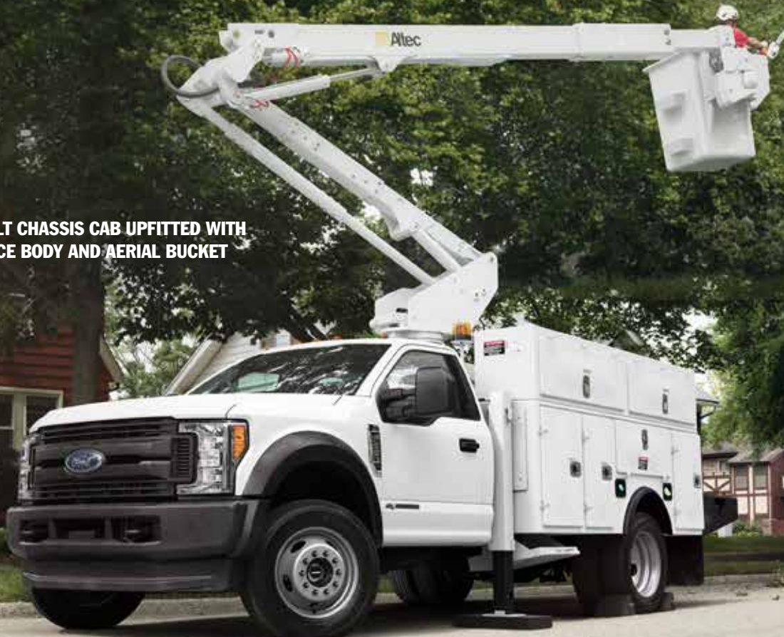
F-550 XLT CHASSIS CAB UPFITTED WITH A SERVICE BODY AND AERIAL BUCKET

/// TORQSHIFT® SELECTSHIFT® 6-SPEED AUTOMATIC WITH PROGRESSIVE RANGE SELECT AND TOW/HAUL MODES