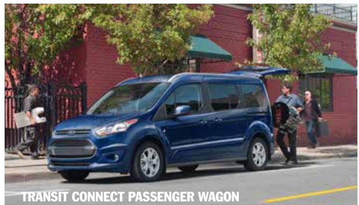
TRANSIT CONNECT PASSENGER WAGON