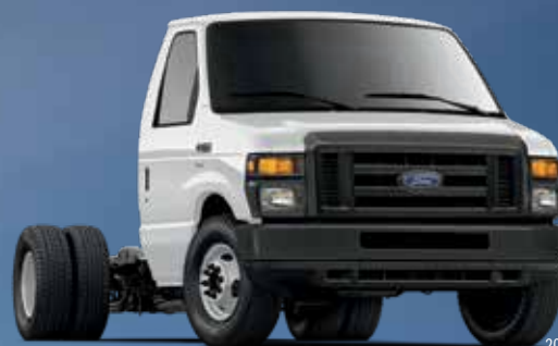
2017 model shown.

CHOOSE AN IDEAL CONFIGURATION TAILORED FOR YOUR BUSINESS OR RECREATION THAT CAN BE EQUIPPED WITH MUSCLE TO TOW AND A RANGE OF AVAILABLE TECHNOLOGIES.