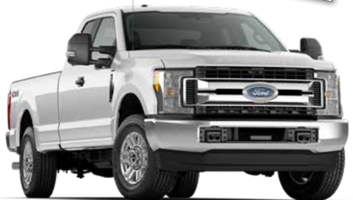
SUPER DUTY® XLT PICKUP