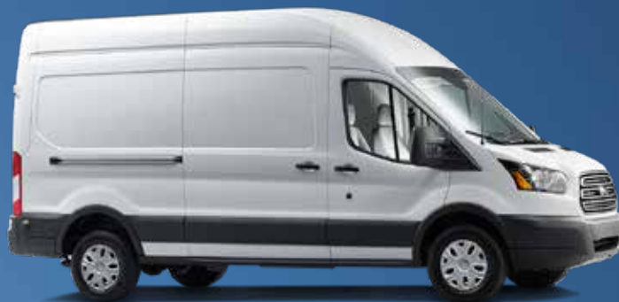
TRANSIT CARGO VANS

DESIGNED WITH BUILT FORD TOUGH DURABILITY AND THE ROOM YOU NEED TO GET THE JOB DONE, WITH UP TO 487 CU. FT. OF CARGO SPACE 4 AND A BROAD SELECTION OF UPFIT PACKAGES.