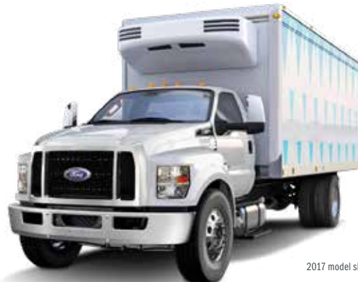
2017 model shown.

GET DOWN TO BUSINESS WITH A BROAD RANGE OF UPFIT POSSIBILITIES, AMPLE FUEL TANK CAPACITY AND TOUGH DIESEL OR GAS ENGINE OPTIONS.