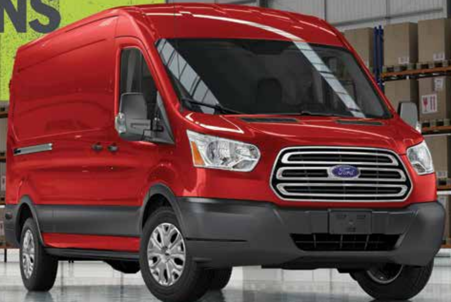
TRANSIT CARGO VAN