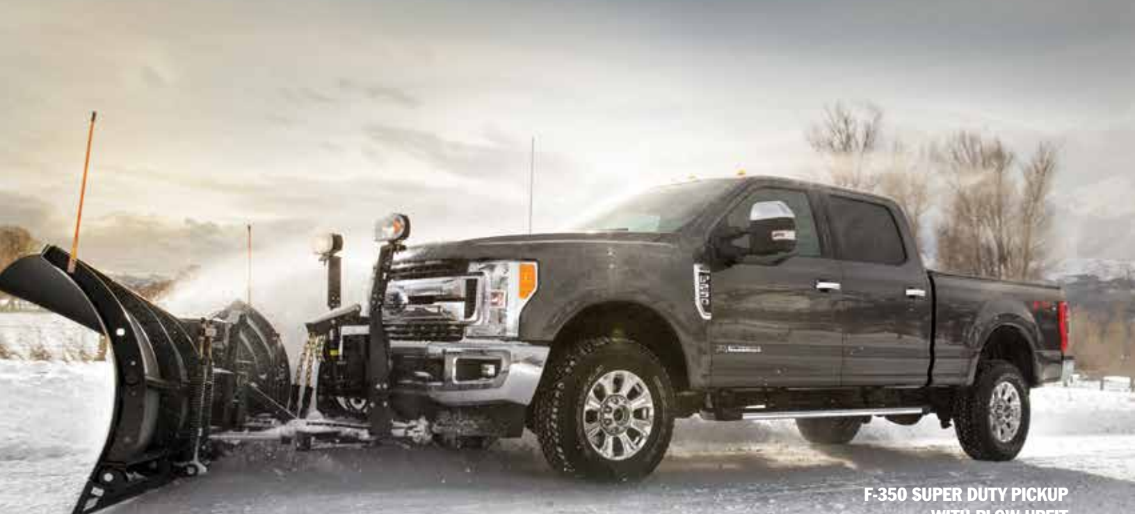
F-350 SUPER DUTY PICKUP WITH PLOW UPFIT

/// THE MOST CAPABLE GENERATION OF SUPER DUTY PICKUP