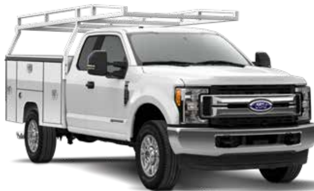
2017 model shown.

THE TOUGHEST, SMARTEST, MOST CAPABLE GENERATION OF SUPER DUTY CHASSIS CABS EVER.