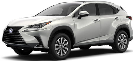
2019 NX 300h

2019 Mercedes-Benz GLC 350e Base 4dr AWD