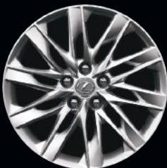
(B) 19-inch cast 5 Base / Interior Upgrade (FM)