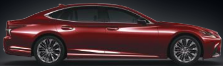
Matador Red Mica