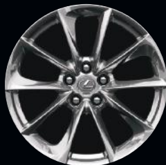
(D) 20-inch forged 5 Executive (FL)