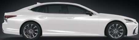
Ultra White (F SPORT)