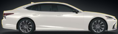
Eminent White Pearl