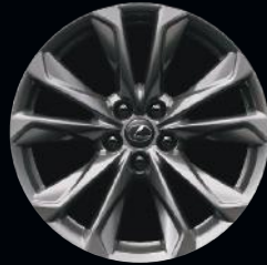
(E) 20-inch cast 5 F-Sport (FT)