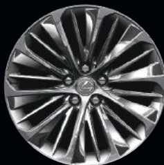
(C) 20-inch cast 5 Luxury (FR)