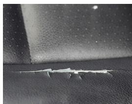
Interior cuts, burns, or stains