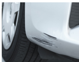
Damaged bumpers, body dents, dings, or scratches