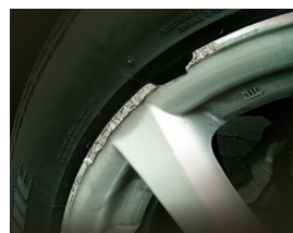
Damage to tires, rims, or hubcaps