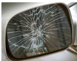
Broken or scratched windshield, windows, mirrors, or lights

Photos are examples of damage commonly covered by Excess Wear and Use (subject to specific agreement terms).