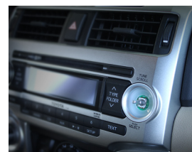
Missing parts or equipment