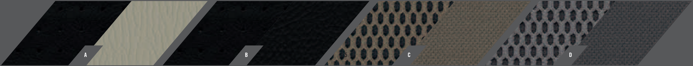
AVENGER INTERIOR COLORS: A) Radar Perforated Leather Trim/Sutton Vinyl in Dark Slate Gray/Light Graystone B) Radar Perforated Leather Trim/Sutton Vinyl in Dark Slate Gray C) Canyons/Racine Premium Stain-Resistant Cloth in Medium Khaki D) Canyons/Racine Premium Stain-Resistant Cloth in Dark Slate Gray