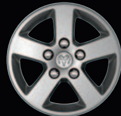
16-inch aluminum wheel (Optional on SE)