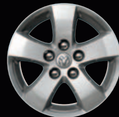
17-inch aluminum wheel (Standard on SXT FWD)