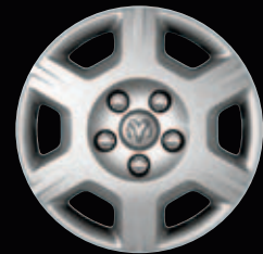
16-inch steel wheel with wheel cover (Standard on SE)