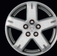
19-inch painted cast aluminum wheel (Standard on SXT AWD and R/T, Optional on SXT FWD)