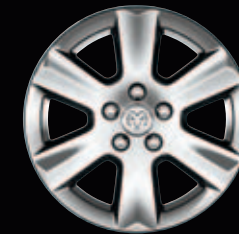
19-inch chrome-clad aluminum wheel (Standard on Crew, Optional on R/T)

TOWING CAPACITY: 2.4-LITER I-4 - 1,000 LB. 3.5-LITER V6 WITH TRAILER TOW GROUP - 3,500 LB.