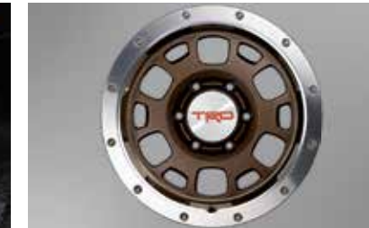
TRD 16" Off-Road Alloy Wheel