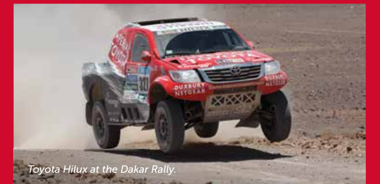
Toyota Hilux at the Dakar Rally.

Performance, quality, and durability are in Tacoma's DNA. In fact, Toyota trucks are backed by a legendary, storied heritage, with 80 years of proven dependability in the world's toughest terrain. Toyota trucks have had more entries in the Dakar Rally than any other brand. They were the first trucks ever driven to the Magnetic North Pole. And the South Pole. With a storied racing heritage that includes 304 off-road wins, 27 manufacturers championships, and 28 off-road drivers' championships, Toyota trucks are winners wherever they travel. Tested the world over, Toyota trucks are the perfect truck for Canada, giving you peace of mind year after year, from coast to coast.