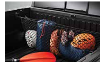
Cargo Net - Envelope