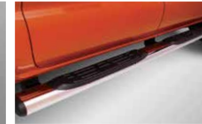
Side Step Bars - 5" Chrome