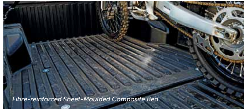
Fibre-reinforced Sheet-Moulded Composite Bed