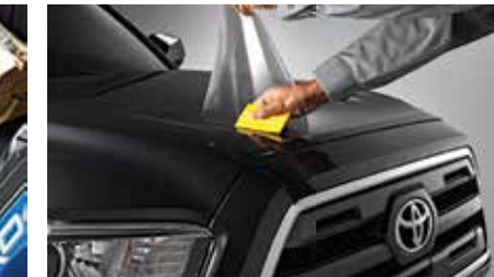
Paint Protection Film