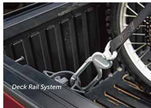
Deck Rail System