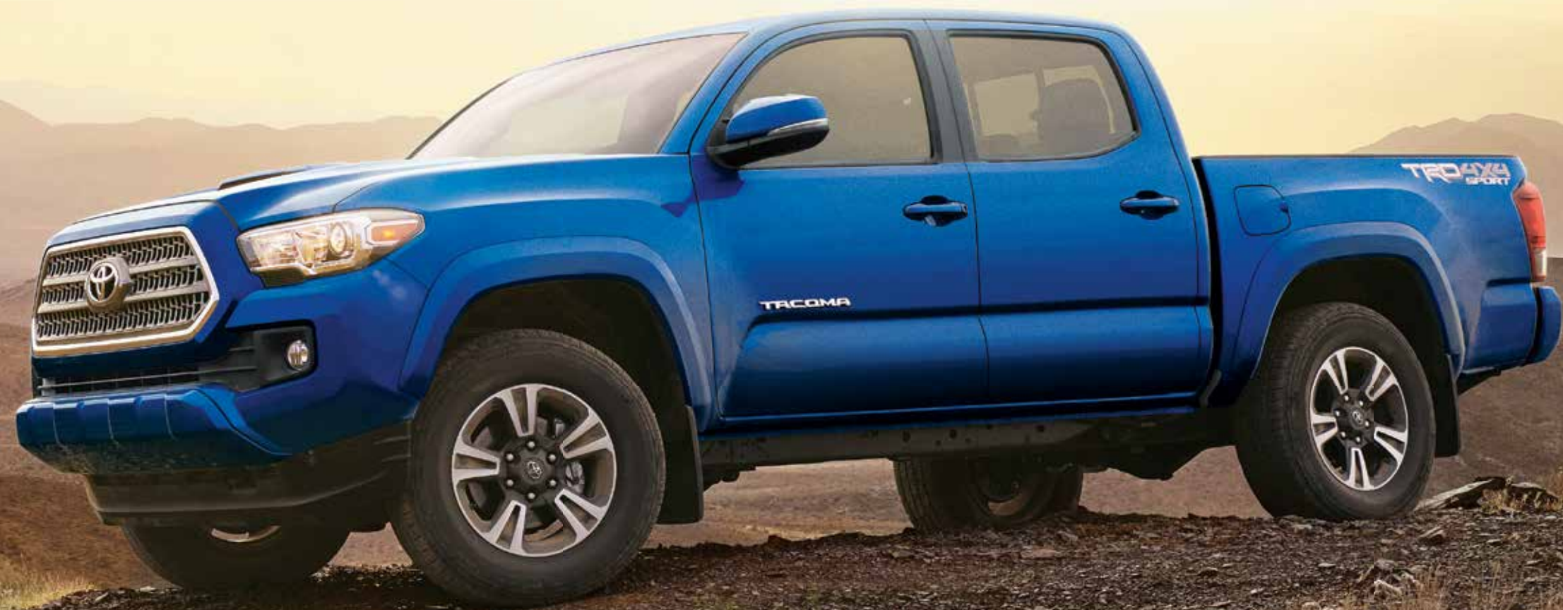
FRONT COVER/PAGE 2 4X4 Double Cab V6 TRD Sport shown in Blazing Blue Metallic.

The all-new 2016 Toyota Tacoma is a piece of serious engineering that's ready for some serious adventure. It has 80 years of global truck heritage backing it up, with the kind of power and muscle you've come to expect from Toyota. The Tacoma is built to outperform, so you can do more than you ever thought possible. And Tacoma looks as good as it works, with sculpted, aggressive lines on the outside, and premium accents and convenient features on the inside. The redesigned 2016 Tacoma. It's built for adventure, today and tomorrow.