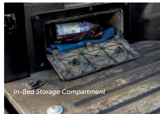
In-Bed Storage Compartment