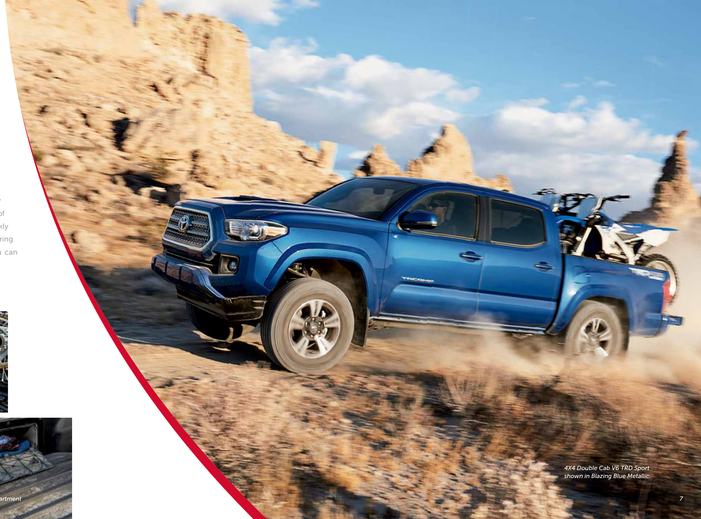
4X4 Double Cab V6 TRD Sport shown in Blazing Blue Metallic.