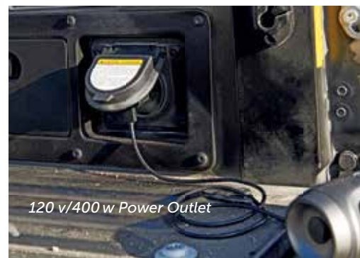
120 v/400 w Power Outlet