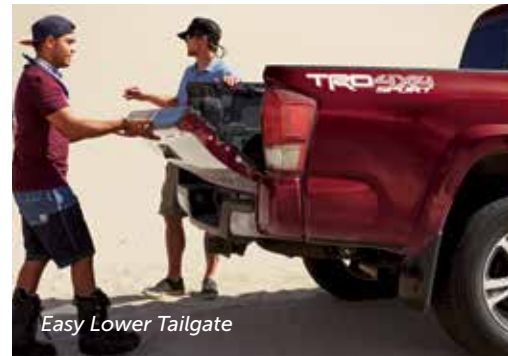
Easy Lower Tailgate

Like you, Toyota Pickups are ingeniously capable. Tacoma was built with serious engineering to allow for serious adventures, so you can take on any challenge with confidence. Tacoma is designed with a high strength steel triple tech frame to improve frame rigidity, as well as ride and handling. The bed features the durability you demand to take on heavy loads and endless use. Made from fibre-reinforced Sheet-Moulded Composite surface, the bed is dent-resistant, and corrosion-free – to keep your truck looking good for years to come. And you'll find that kind of attention to detail all over the vehicle, with convenient features that allow you to strap your gear down with ease to make sure when you're playing hard, nothing gets out of place. Then there's the easy lower tailgate, which opens using just two fingers, and can be quickly removed when needed. And as a final testament to its quality and durability, it's worth remembering over 85% of Toyotas sold in Canada in the last 20 years are still on the road today. 1,2 So you can count on Tacoma to outperform for many tomorrows to come.