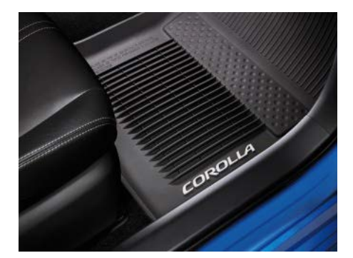
All-weather floor liners<sup>38</sup>

This is a great way to add extra personality to your Corolla Hatchback. Not every accessory is available in your area, so for a complete list of accessories, go to toyota.com/corollahatchback/accessories.