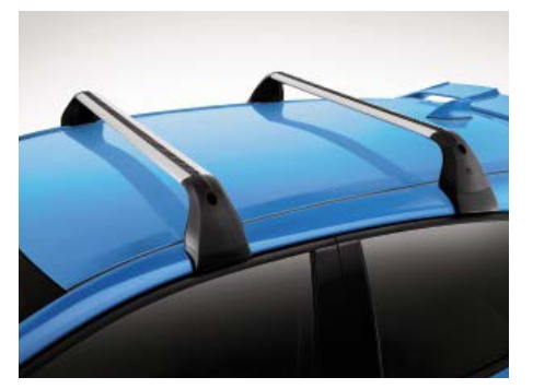
Removable cross bars