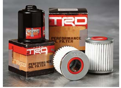
TRD oil filter