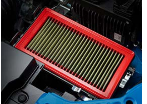
TRD air filter