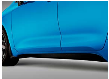
Lower rocker appliqué