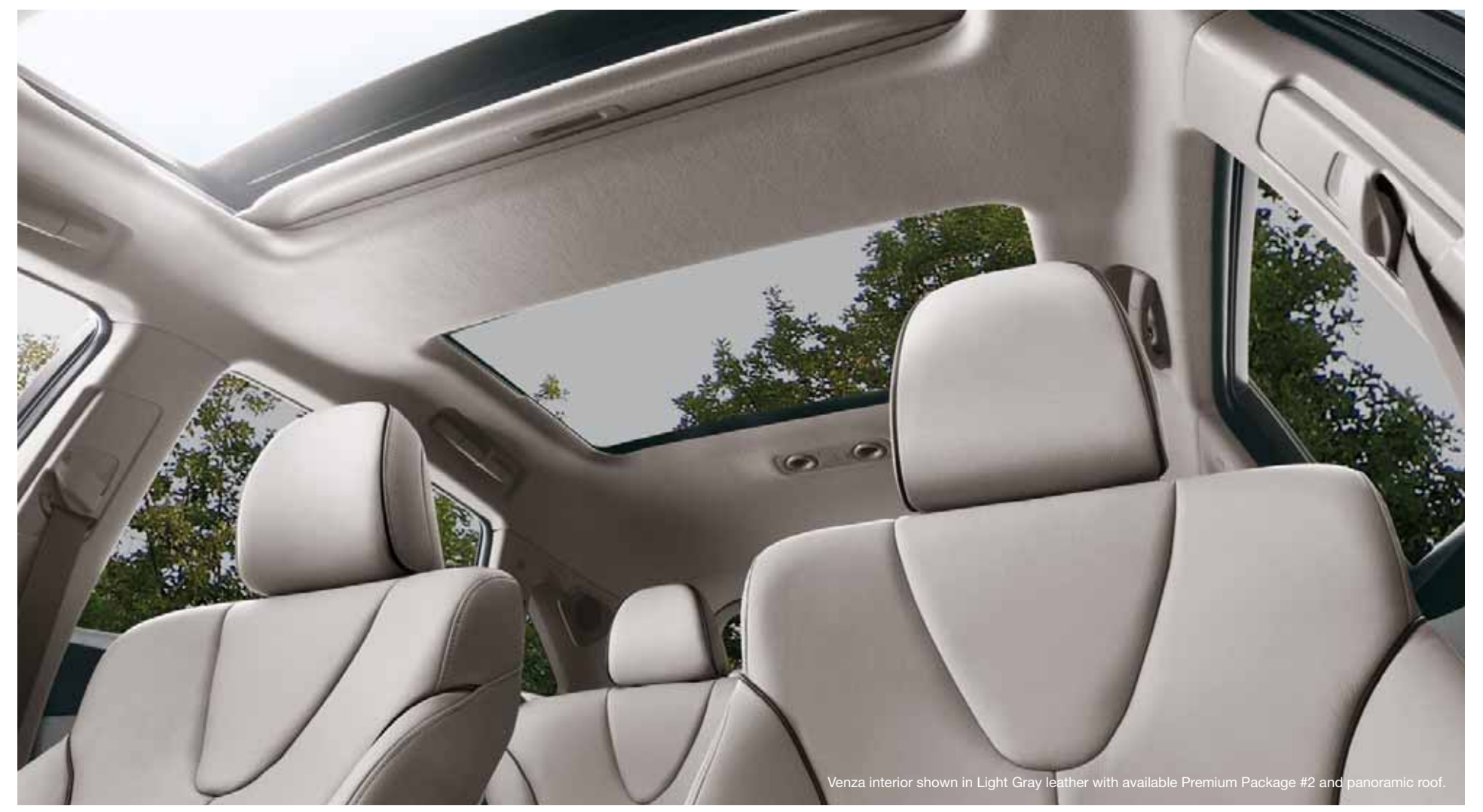
1. See footnote 8 in Disclaimers section. 2. See footnote 7 in Disclaimers section.

An available backup camera displays the area behind the vehicle visible to the camera on the available Multi-Information Display. Or, on vehicles equipped with the available voice-activated touch screen DVD navigation system, it is displayed on the screen.