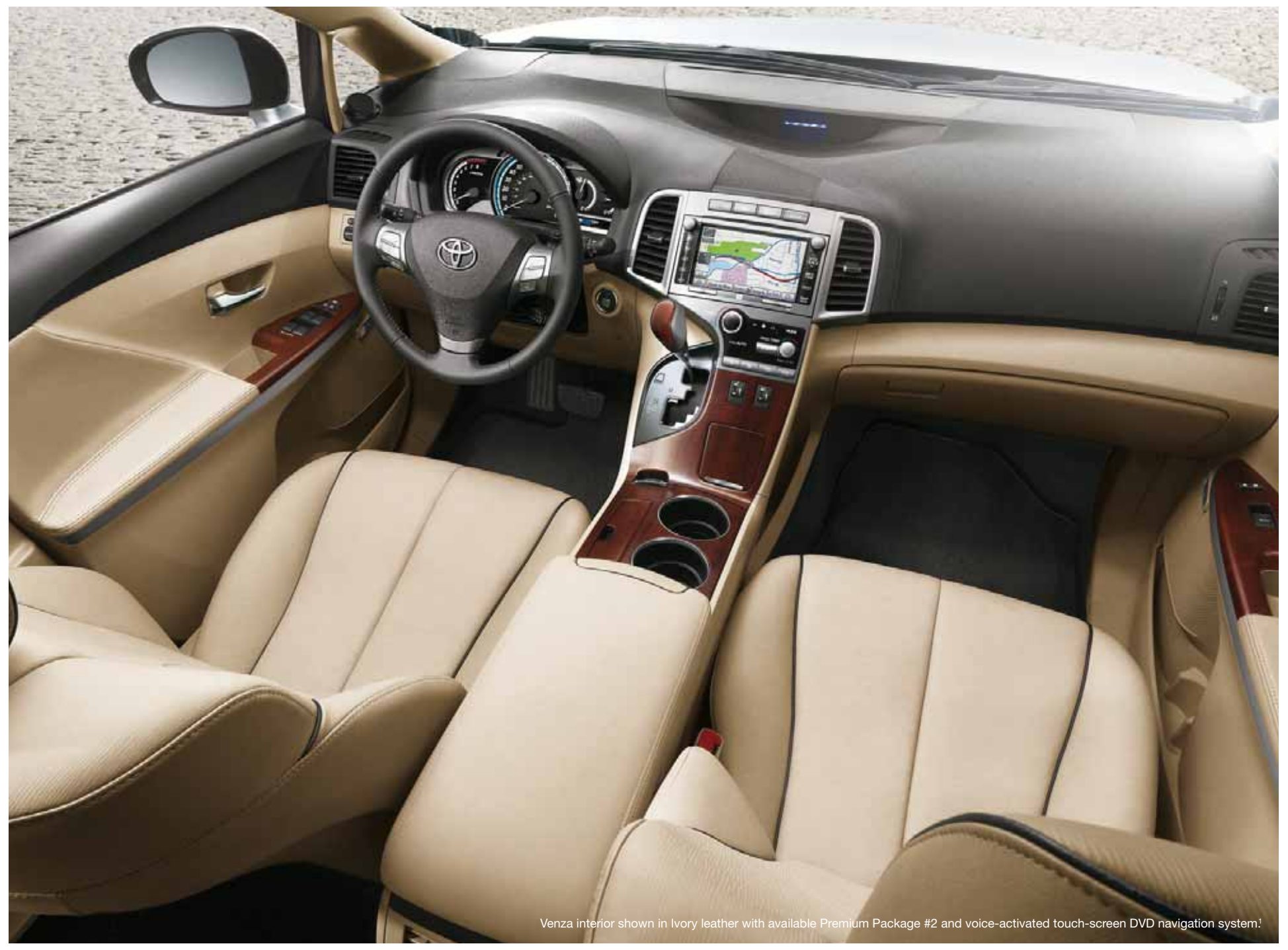
1. See footnote 7 in Disclaimers section.