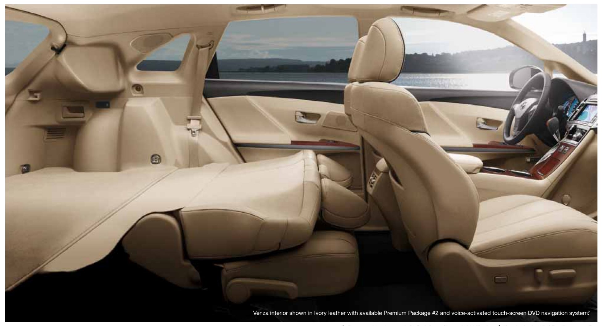
1. Cargo and load capacity limited by weight and distribution. 2. See footnote 7 in Disclaimers section.

It's as flexible as your schedule demands. Running an errand that requires you to carry big, bulky items? No problem. With its rear seatbacks folded down, Venza has up to 70.1 cubic feet of cargo space. And its rear seat features a 60/40 split, so you can carry a rear-seat passenger and still have expansive space left to hold the things you need to haul. Even with the rear seats reclined and all the seats occupied, there's still plenty of room left in the cargo area for everyone's luggage.