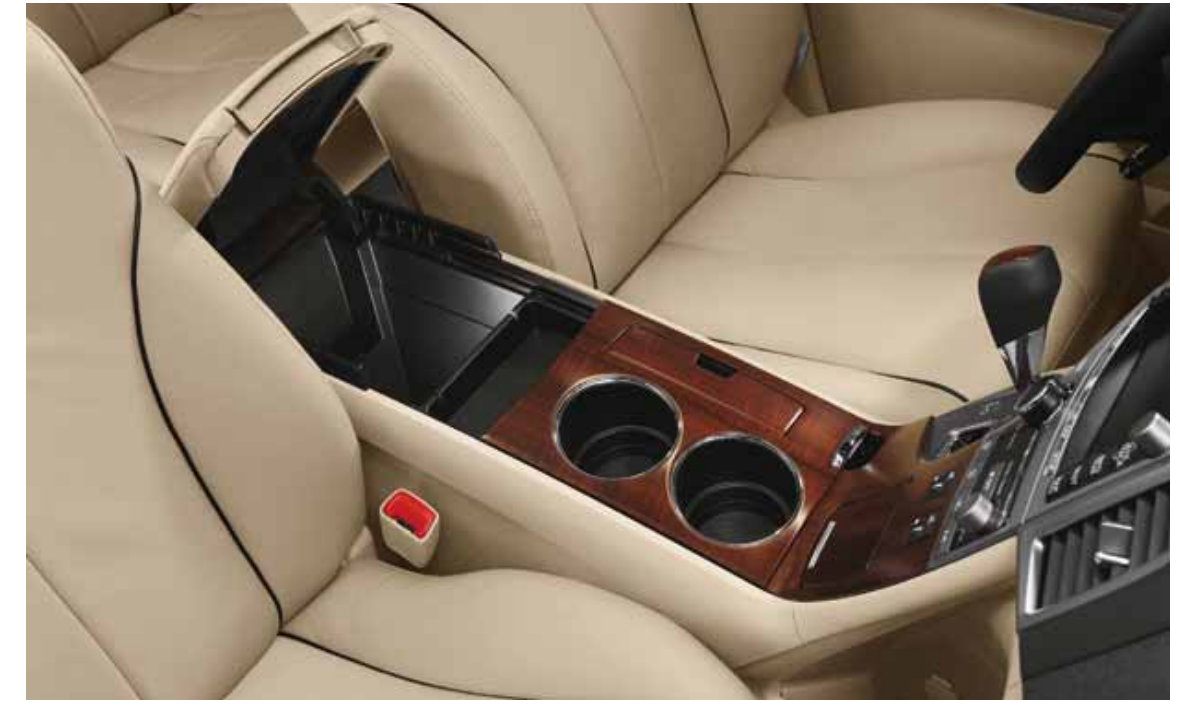
1. See footnote 13 in Disclaimers section.