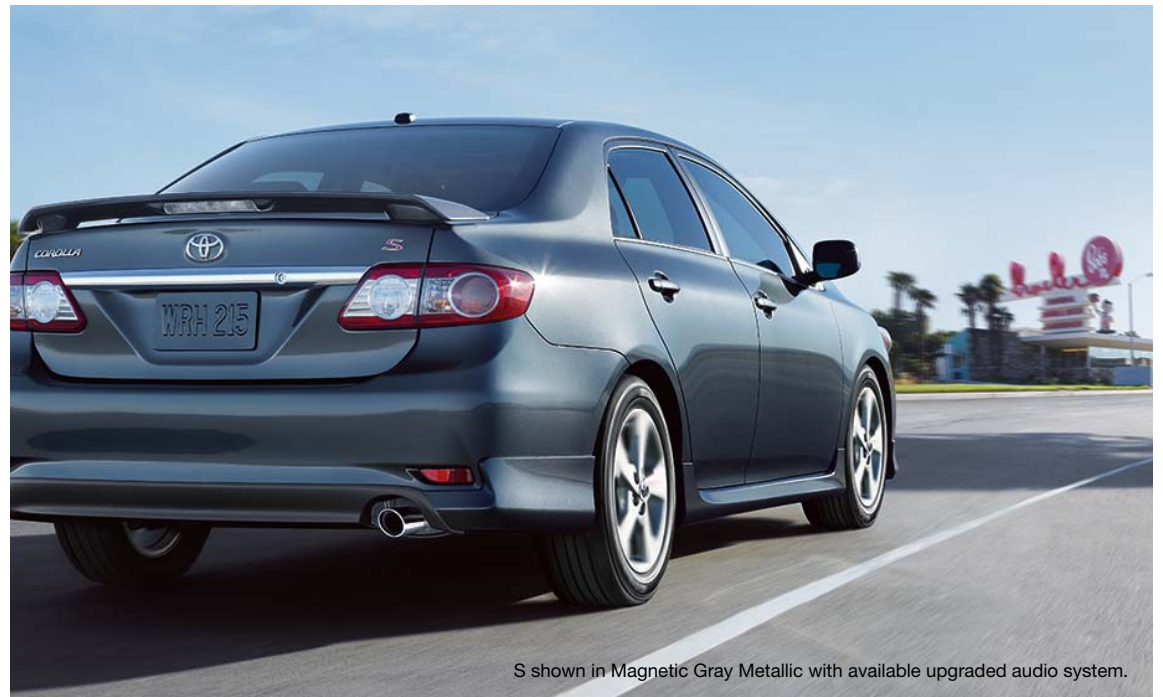
S shown in Magnetic Gray Metallic with available upgraded audio system.

Corolla's impeccable road manners begin with its rigid chassis. Built to resist body flex, it provides a reliable platform so that the suspension can best do its job. The front suspension, mounted to an additional sub-frame to reduce noise and vibration , is tuned for precision handling. In back, the rear suspension employs a torsion-type design that further smooths the ride quality .