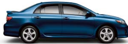
NAUTICAL BLUE METALLIC Ash, Bisque or Dark Charcoal 1 interior