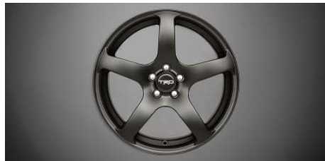
TRD 18-in. 5-spoke wheels (Silver or Black)