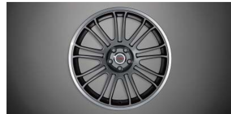
TRD 18-in. multi-spoke alloy wheels