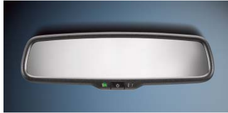
Auto-dimming rearview mirror