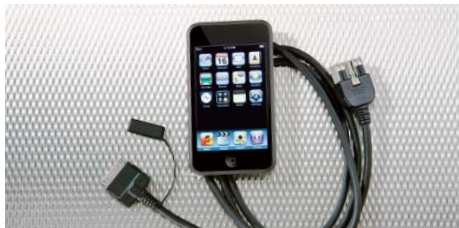
Interface kit 20 for iPod ®11