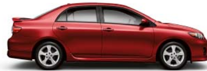
BARCELONA RED METALLIC Ash, Bisque or Dark Charcoal 1 interior