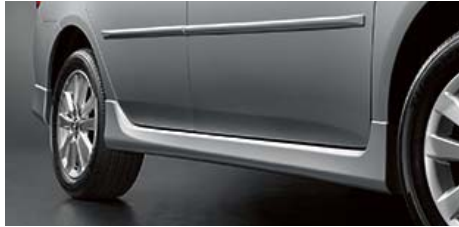
Body side moldings

Add a personal touch to your Corolla with Genuine Toyota accessories. Some accessories may not be available in all regions of the country. See your Toyota dealer for details.