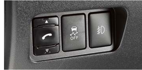
BLU Logic® Hands Free System 19