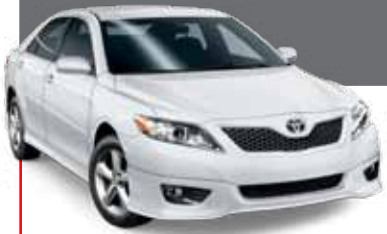
Exposed Tire Cord