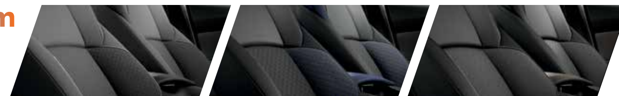
LE fabric shown in Black with Gunmetal accent