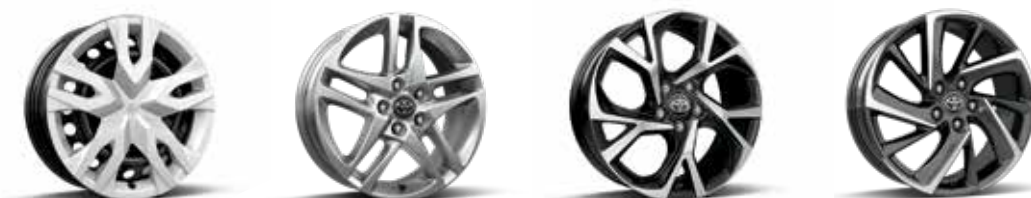
17-in. steel wheel