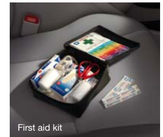
First aid kit