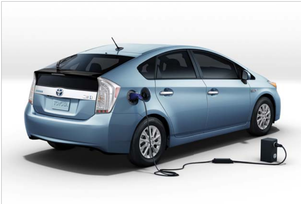
Prius Plug-in Hybrid Advanced shown in Clearwater Blue Metallic.