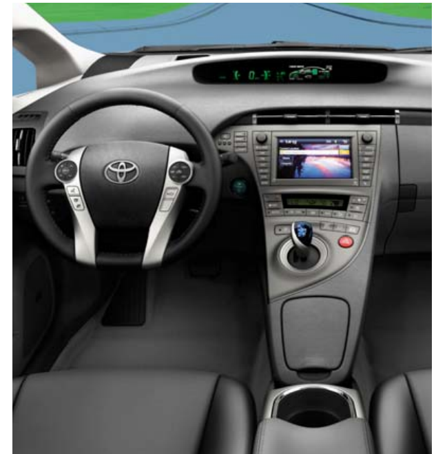
Interior shown with Dark Gray SofTex-trimmed seats.

The Prius Plug-in Hybrid is engineered for enhanced electric driving range, and it allows you to charge its lithium-ion battery using a common household outlet. A 120V outlet 1 will completely charge the battery in about three hours, while a 240V outlet will charge it in about half that time. It can drive up to 15 miles on electric power alone, and it's capable of traveling up to 62 mph 2 in EV 3 mode. In hybrid mode, its mileage has been estimated at 49 mpg 4 Moving Forward.