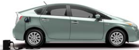
SEA GLASS PEARL