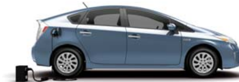
CLEARWATER BLUE METALLIC