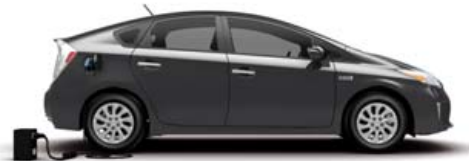
WINTER GRAY METALLIC