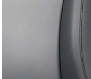
FABRIC in Dark Gray