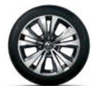
16" split-V alloy