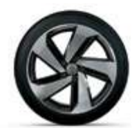
18" 5-spoke two-tone machined alloy