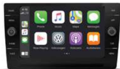
Apple CarPlay integration for your iPhone shown.

App-Connect allows you to connect your compatible smartphone with Apple CarPlay® (below), Android Auto™, or MirrorLink® to access select apps on the touchscreen display. From streaming music to mobile apps, it can be accessed on the touchscreen.