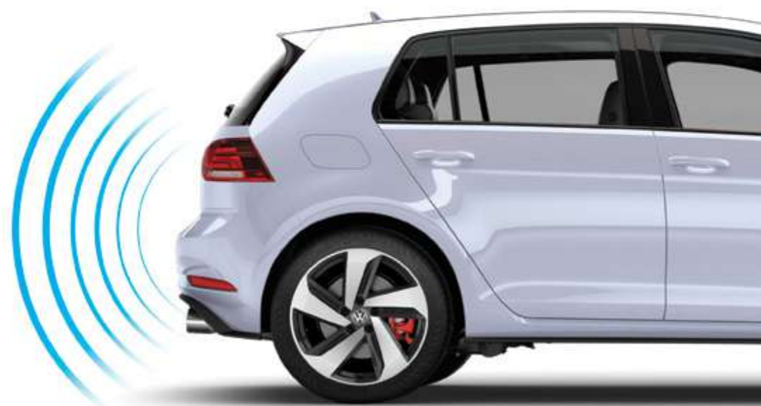
Rear Traffic Alert*