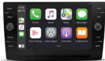
Apple CarPlay integration for your iPhone shown.

App-Connect allows you to connect your compatible smartphone with Apple CarPlay® (below), Android Auto™, or MirrorLink® to access select apps on the touchscreen display. From streaming music to mobile apps, it can be accessed on the touchscreen.