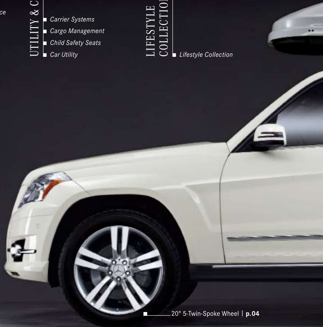
■ 20" 5-Twin-Spoke Wheel | p.04