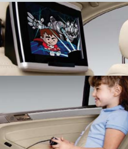
shown on M-Class

Your passengers are entertained and because DVD audio plays over wireless headsets, the driver can concentrate on driving with fewer distractions.