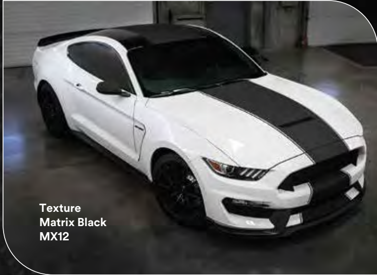
Texture Matrix Black MX12