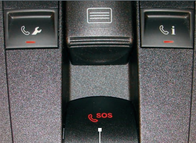
In your vehicle