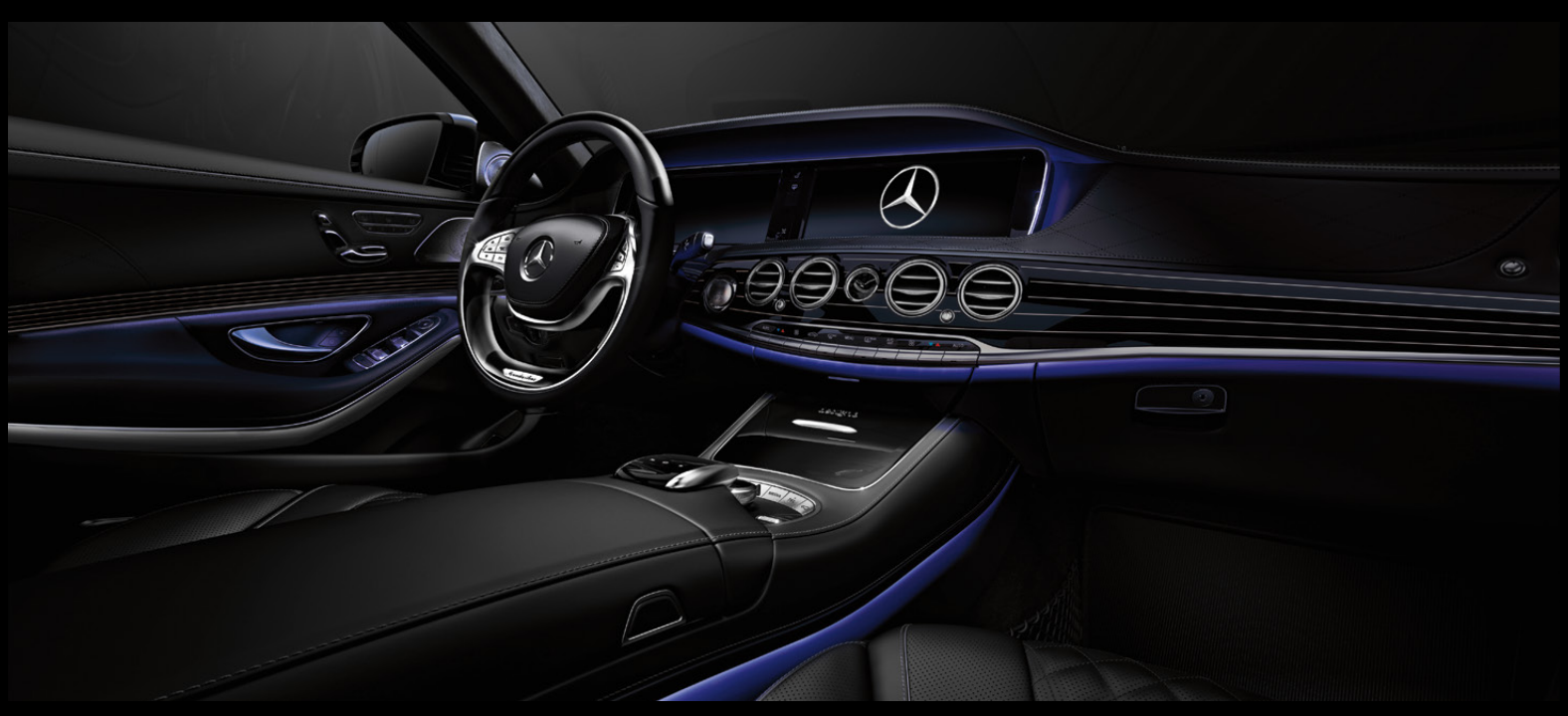
*Optional or not available on some models. Please see back of brochure.