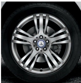
19" triple 5-spoke