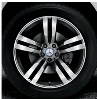
20" twin 5-spoke (Appearance Package)