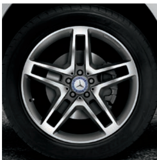
20" AMG twin 5-spoke (AMG Styling Package)