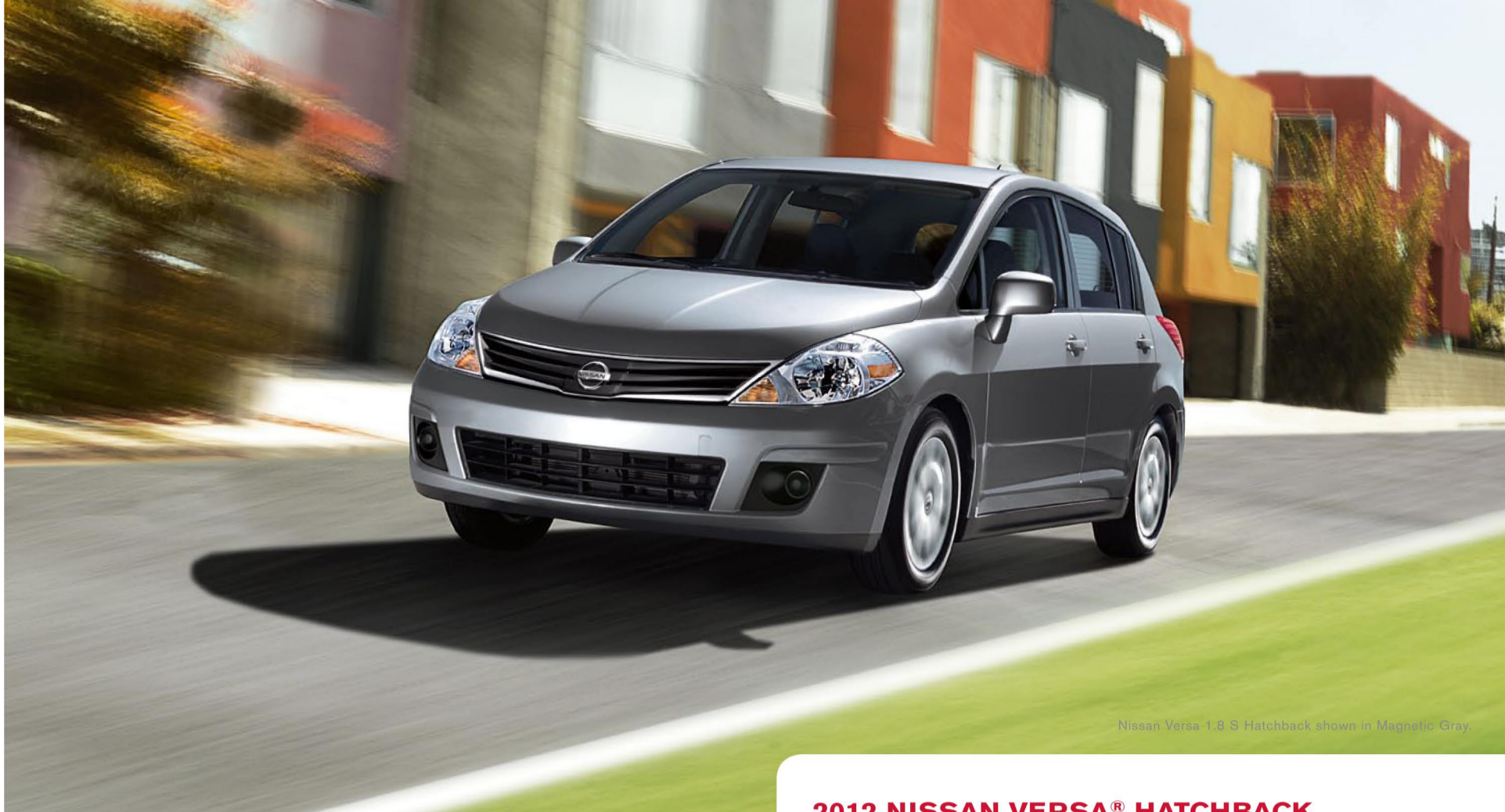
Nissan Versa 1.8 S Hatchback shown in Magnetic Gray.