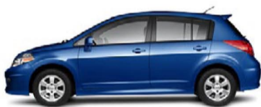
1.8 SL: ADDS UNEXPECTED FEATURES