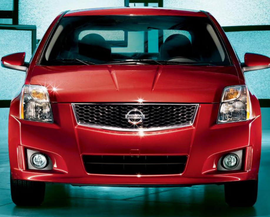
Nissan Sentra 2.0 SL shown in Red Alert.