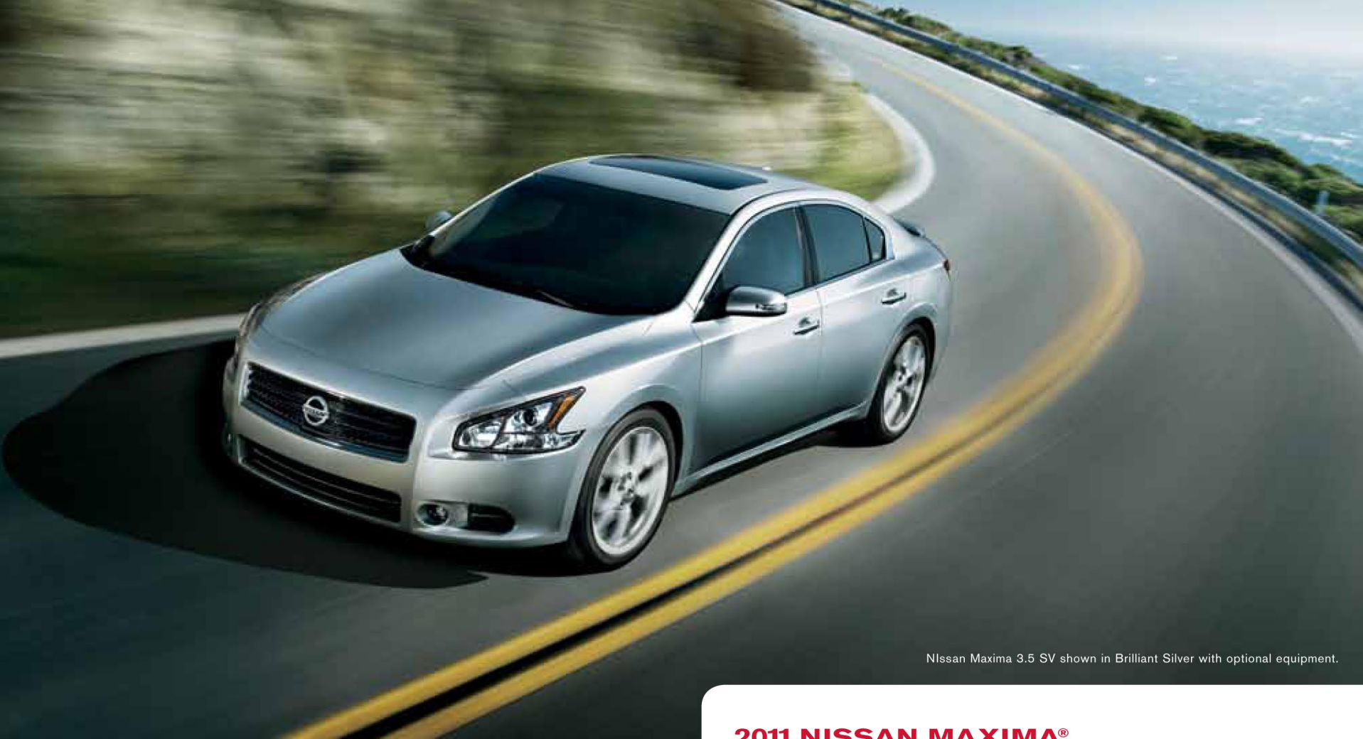
Nissan Maxima 3.5 SV shown in Brilliant Silver with optional equipment.