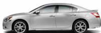
3.5 SV: WITH SPORT PACKAGE