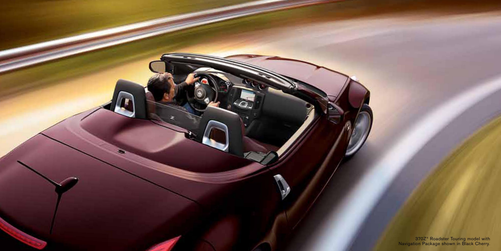
370Z ® Roadster Touring model with Navigation Package shown in Black Cherry.