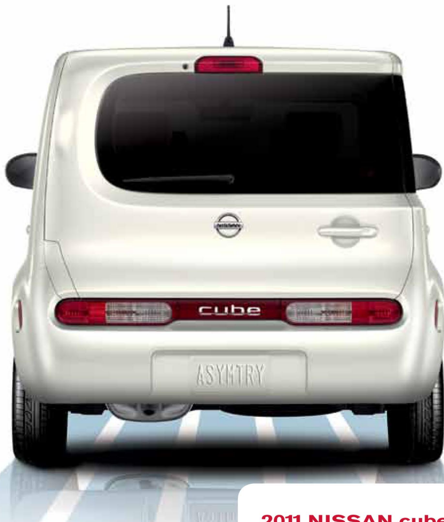
cube® 1.8 SL in White Pearl.