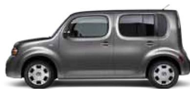
1.8 S: ADD IN EXTRA AMENITIES.