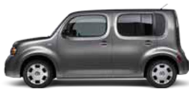
1.8: START HERE.