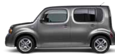
1.8 SL: IT'S YOUR MOBILE DEVICE.