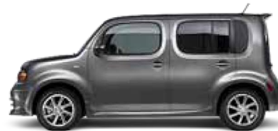
1.8 S: WITH OPTIONAL KRÖM® EDITION. 1